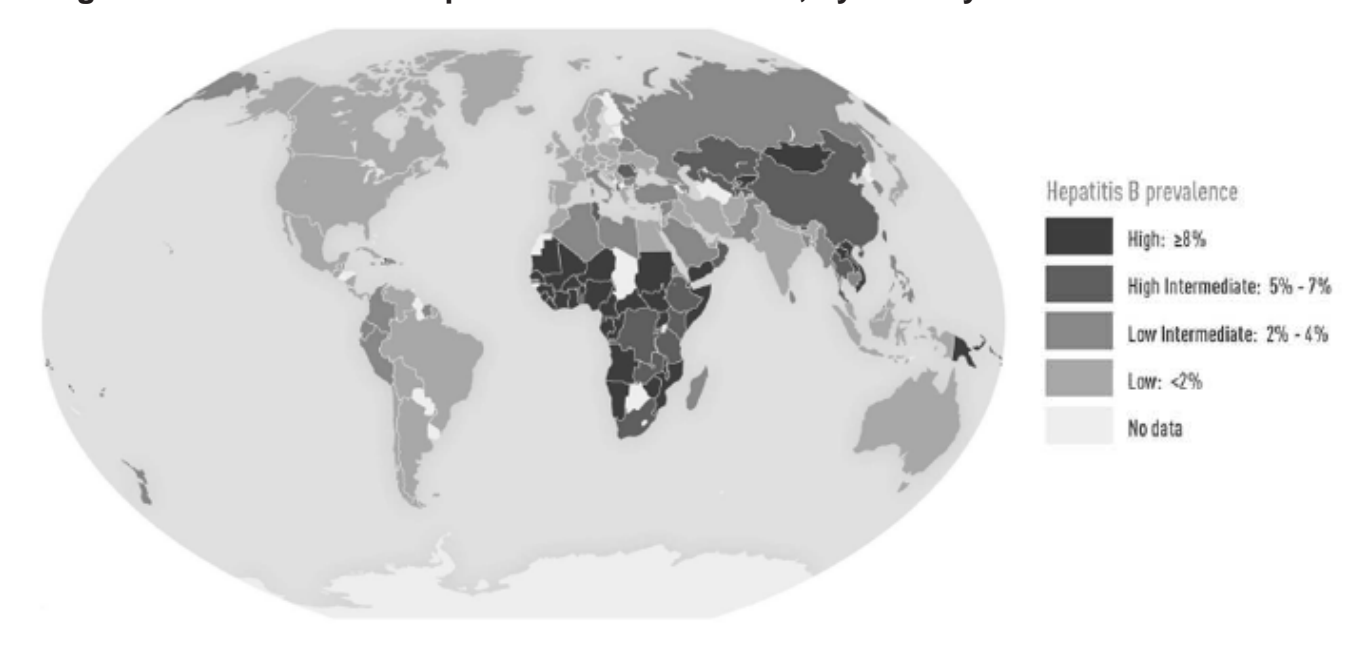
Figure 2. Prevalence of hepatitis B virus infection, by country

MAP 3-4. Prevalence of hepatitis B virus infection Disease data source: Schweitzer A, Horn J, Mikalajczyk R, Krause G, Ott J. Estimations of worldwide prevalence of chronic hepatitis B virus infection: a systematic review of data put