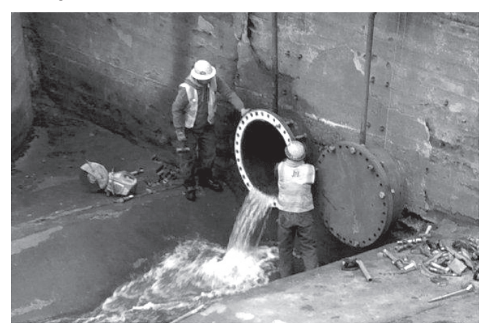
The Portland Water Bureau completed disconnection of the Mt. Tabor open finished water reservoirs in late December, 2015, as required by the EPA Long-term 2 Enhanced Surface Water Treatment Rule.