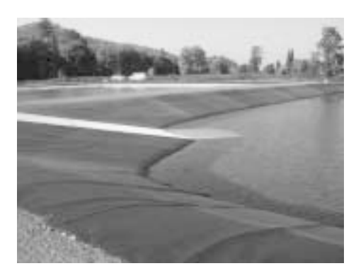
Slow Sand Filters at Springfield Utility Board's Willamette Well Field

to 40 communities in the total amount of $62.3M (see photo below of ultraviolet light disinfection unit constructed by Springfield Utility Board at the 9 MGD Willamette Well Field). Many more communities are in process of applying for safe drinking water project loans. Keep those projects coming!