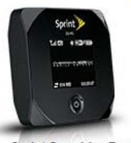
Sprint Overdrive Pro