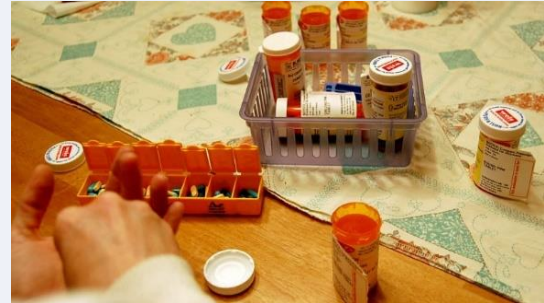
Building a reserve of prescriptions medications for the 2 weeks ready emergency kit

Check out additional information from OHA , OEM , Consumer Reports , and your local services.