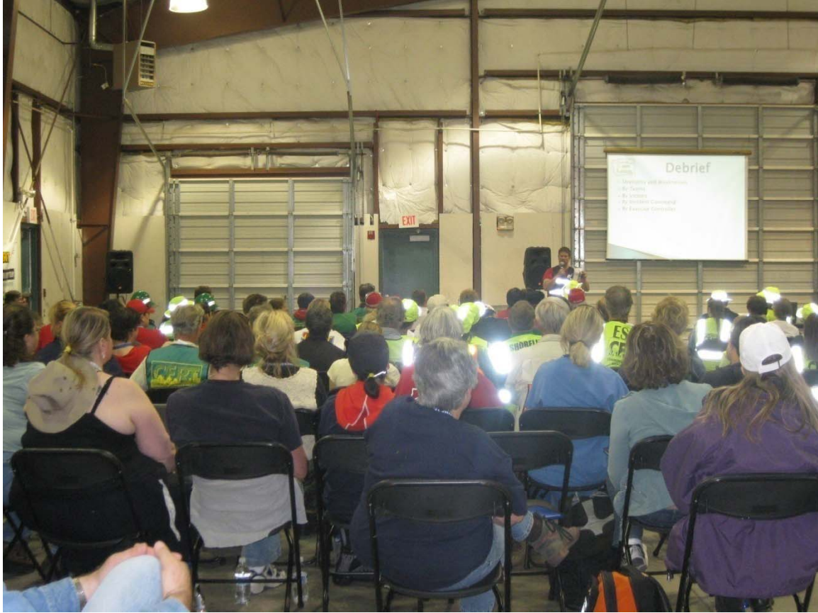
Exercise Debrief cont.