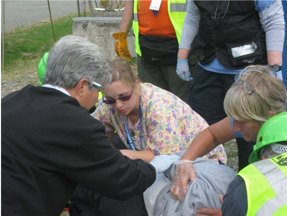
Careful patient movement...