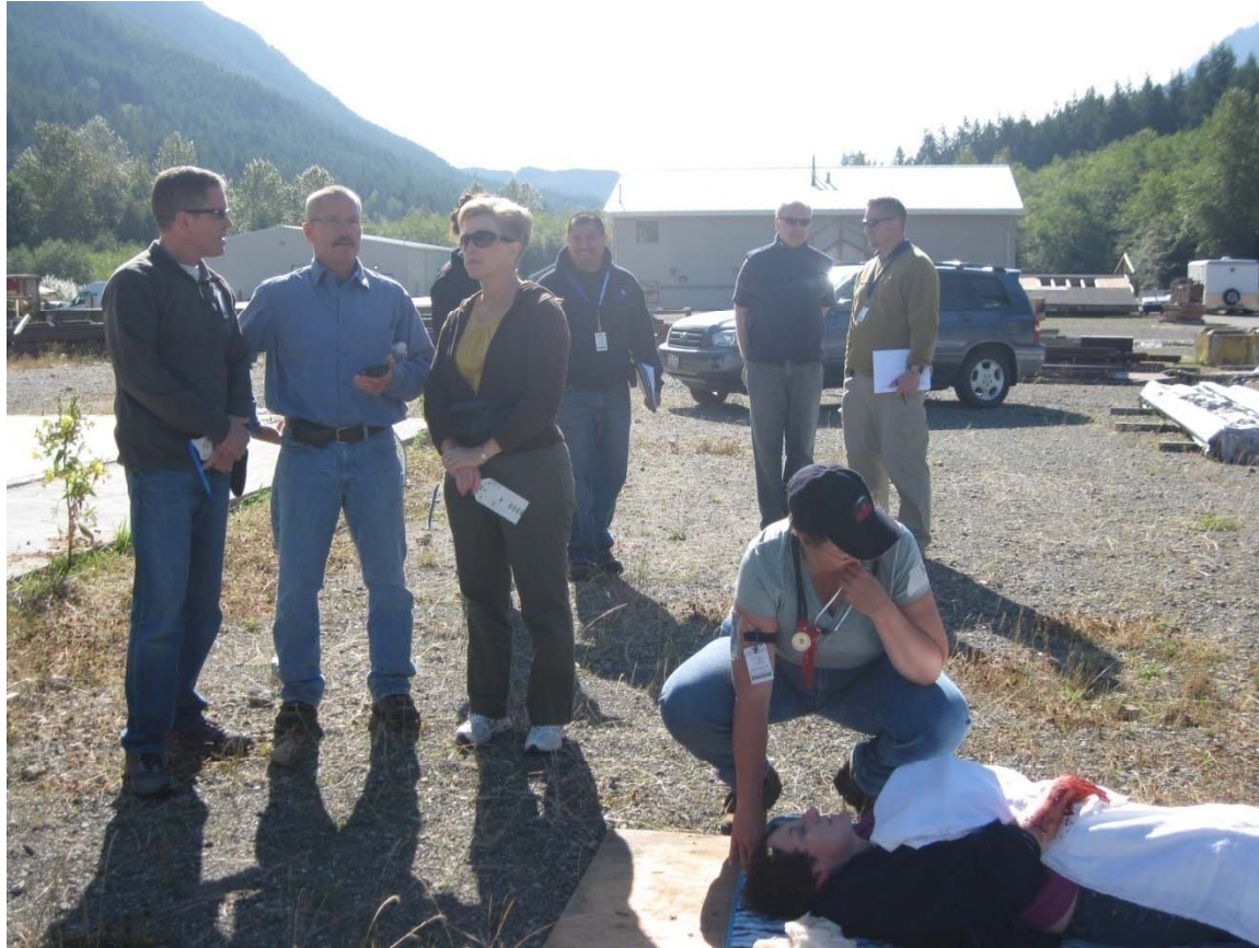
Evaluators reviewing the treatment site