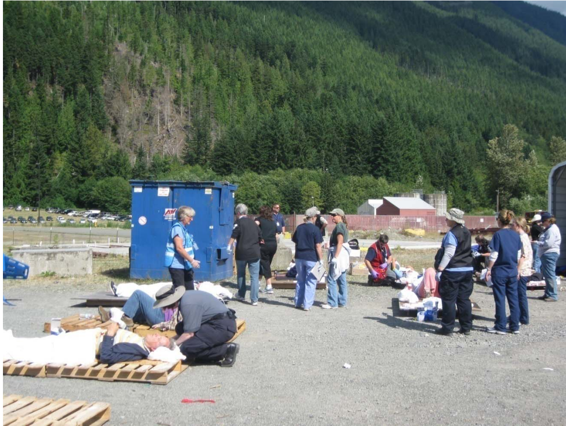
Very Busy at the MRC Team 2 Treatment area