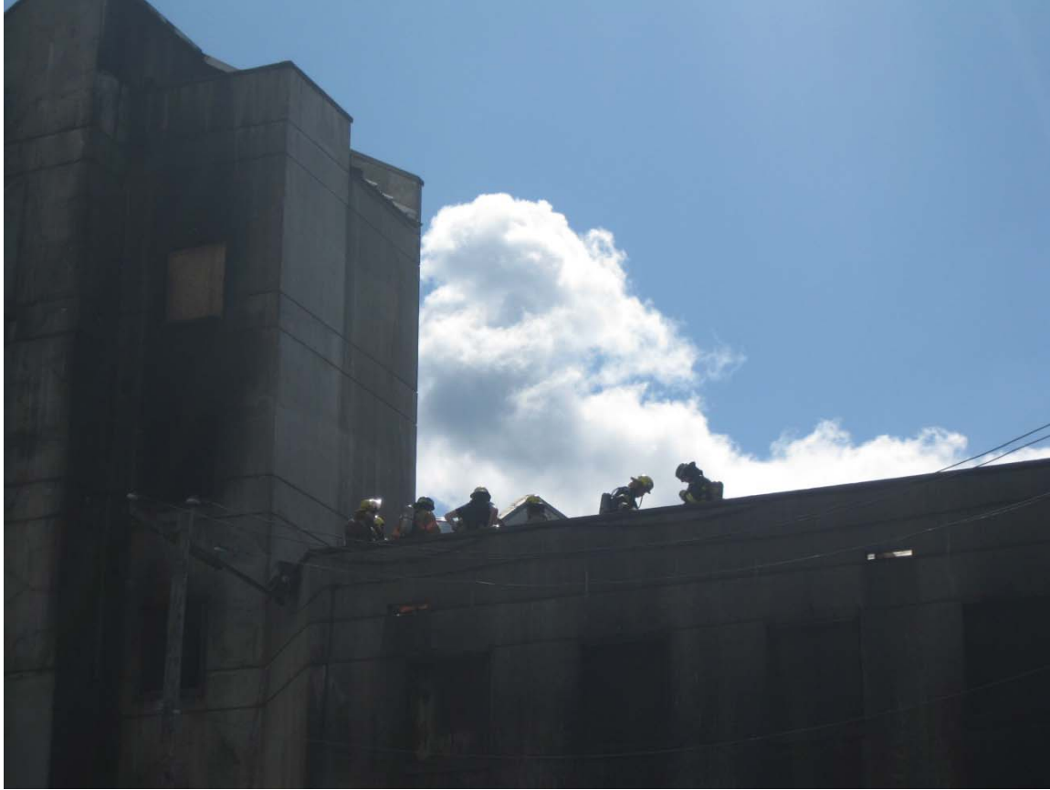
Firefighters checking on us!