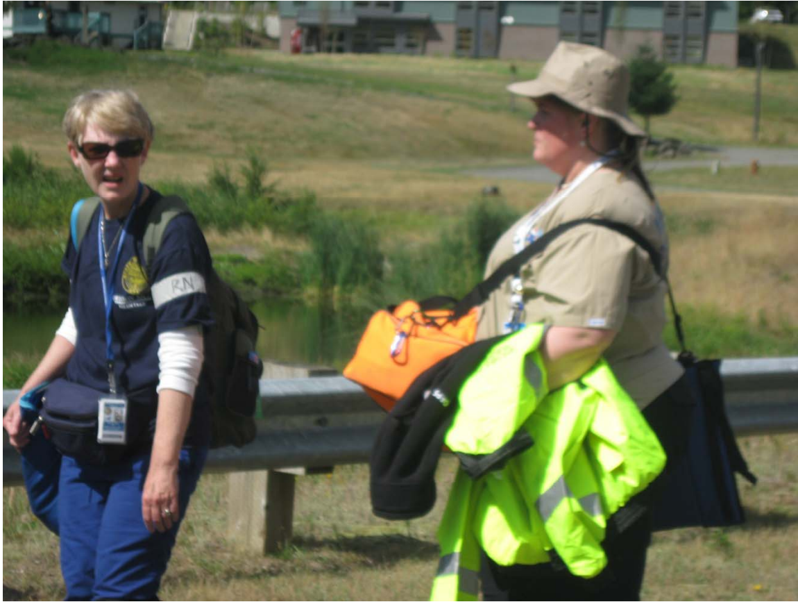
On the way to lunch!