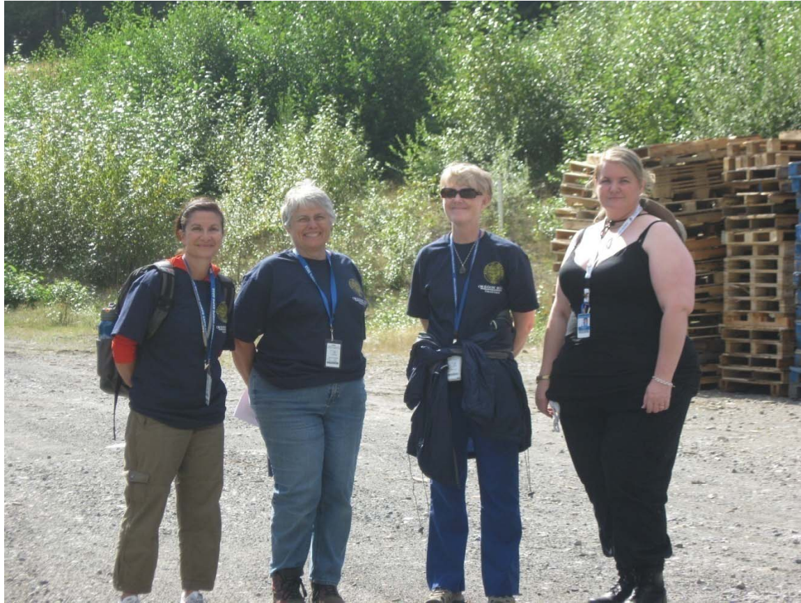
MRC Team 1 members observing Team 2's Medical Treatment area