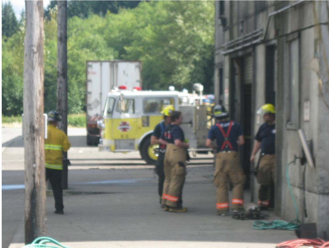
Firefighter Training Across the street from the Medical Treatment Area