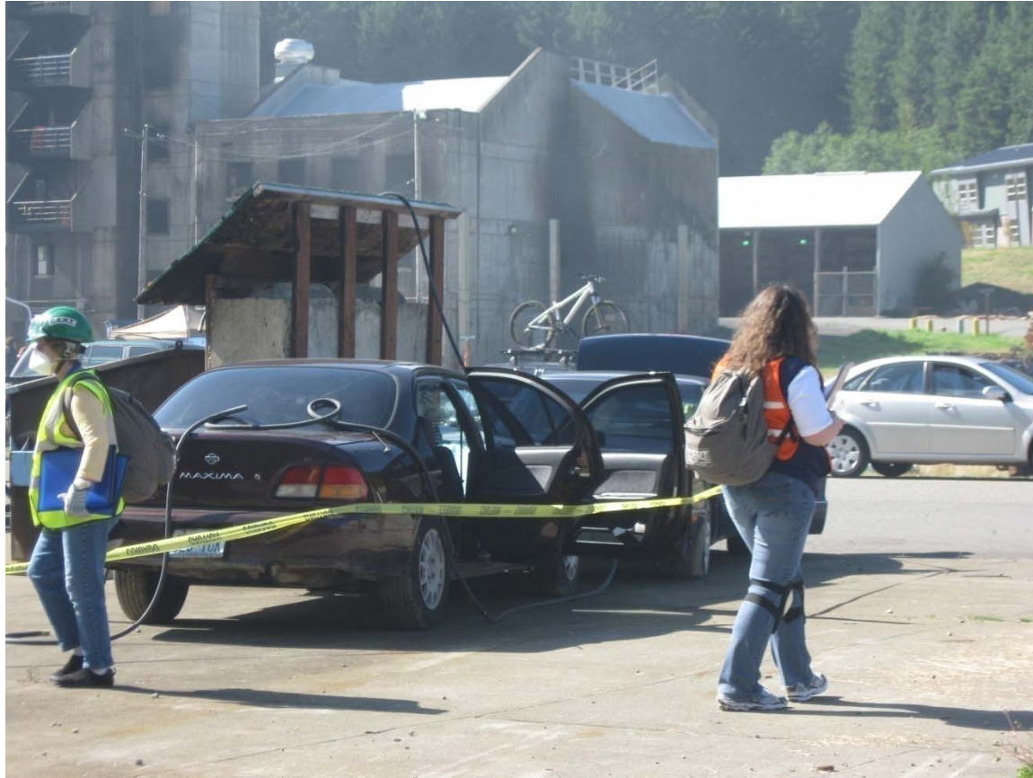
CERT volunteers sizing up accident scene