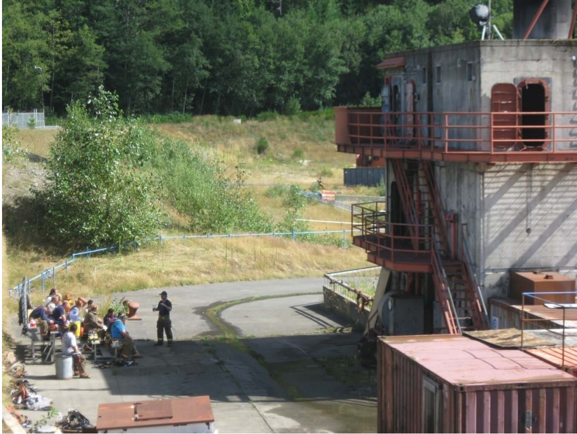
Another training class