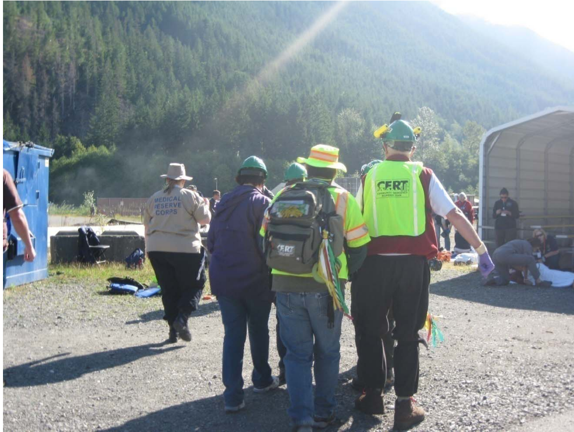
CERT volunteers carrying victim into medical treatment area