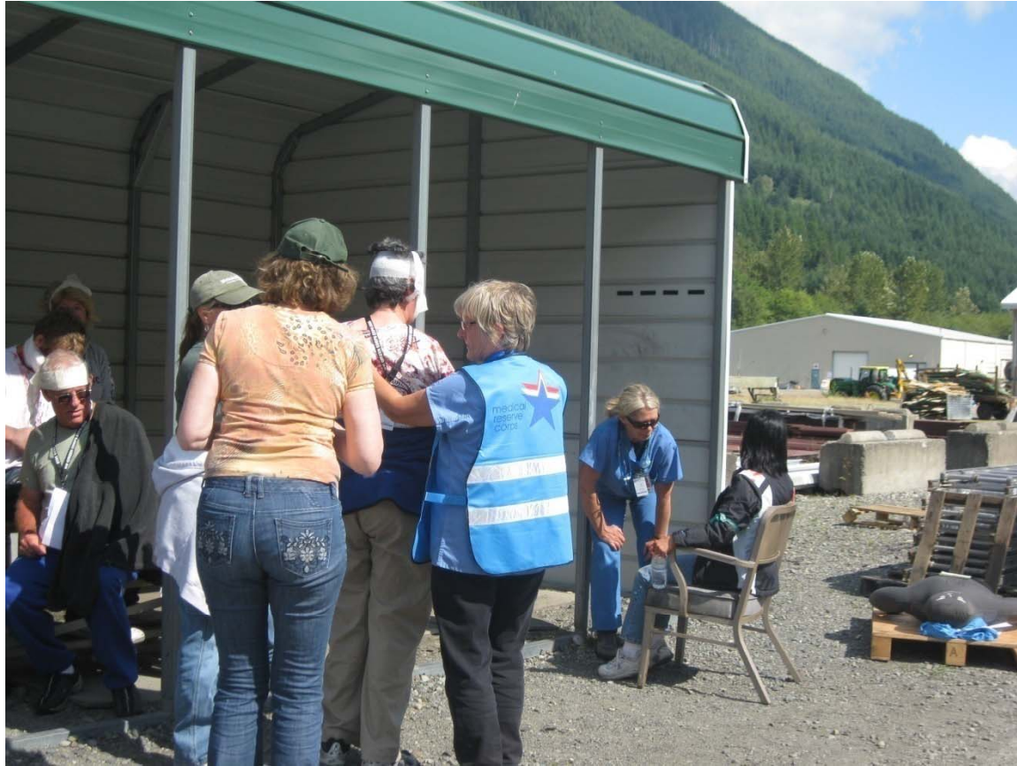
Checking up on the green patients (minor injuries)