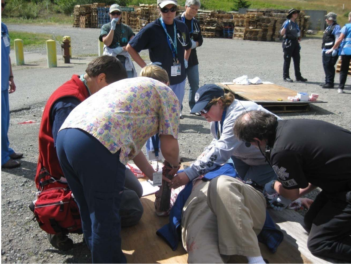
MRC Team 2 volunteers assisting patient to bed