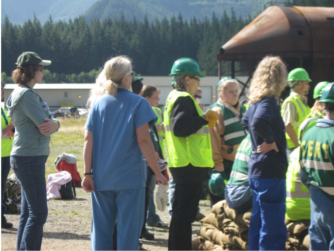
MRC Volunteers and CERT members trained together