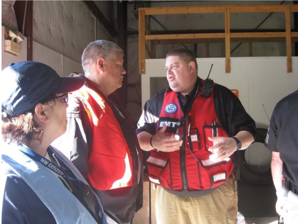
Exercise Safety Officers