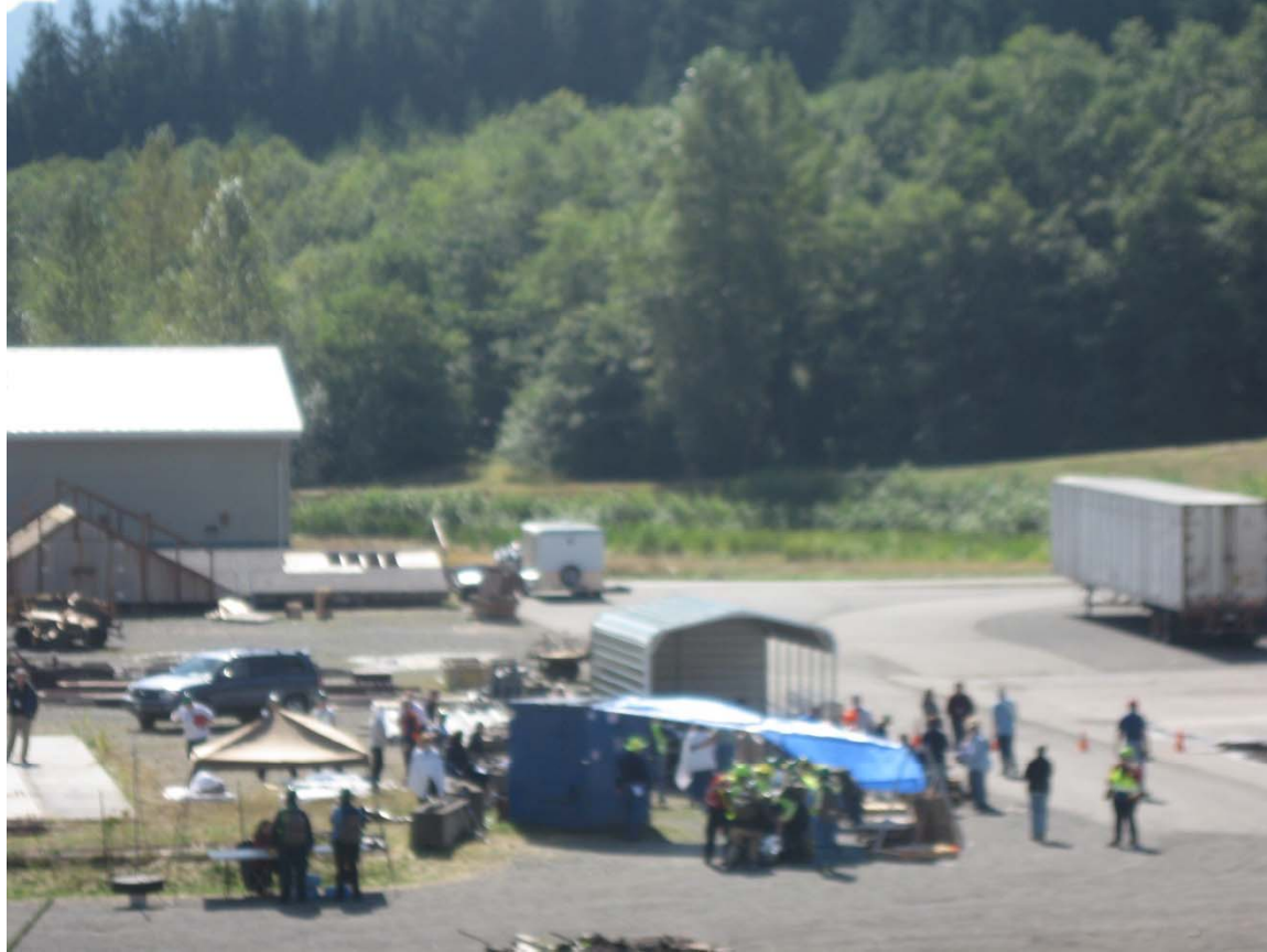
View of the medical treatment area from hill