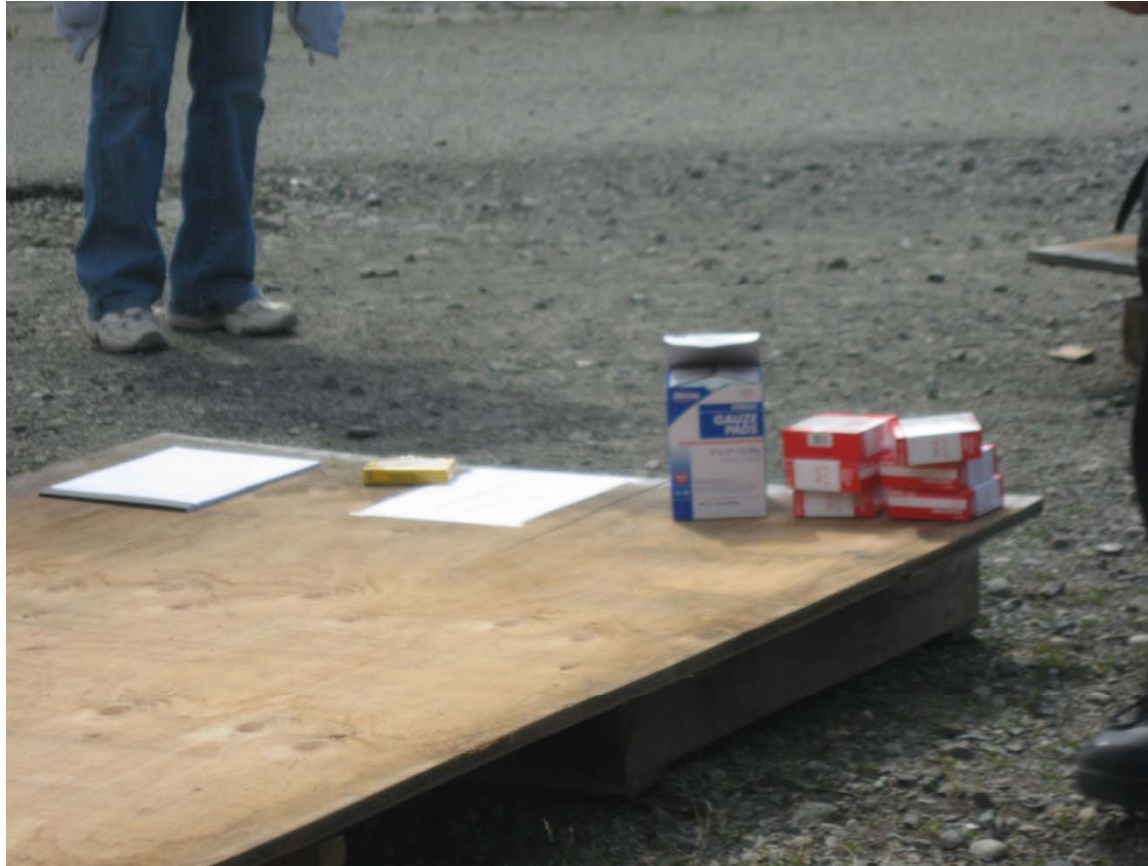
A comfortable bed waiting for a patient