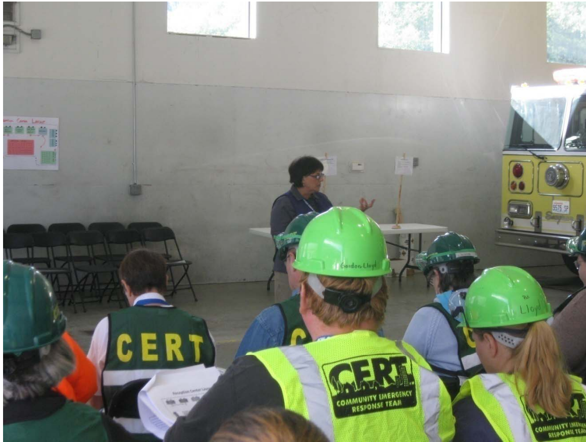
Volunteer Reception Center Training