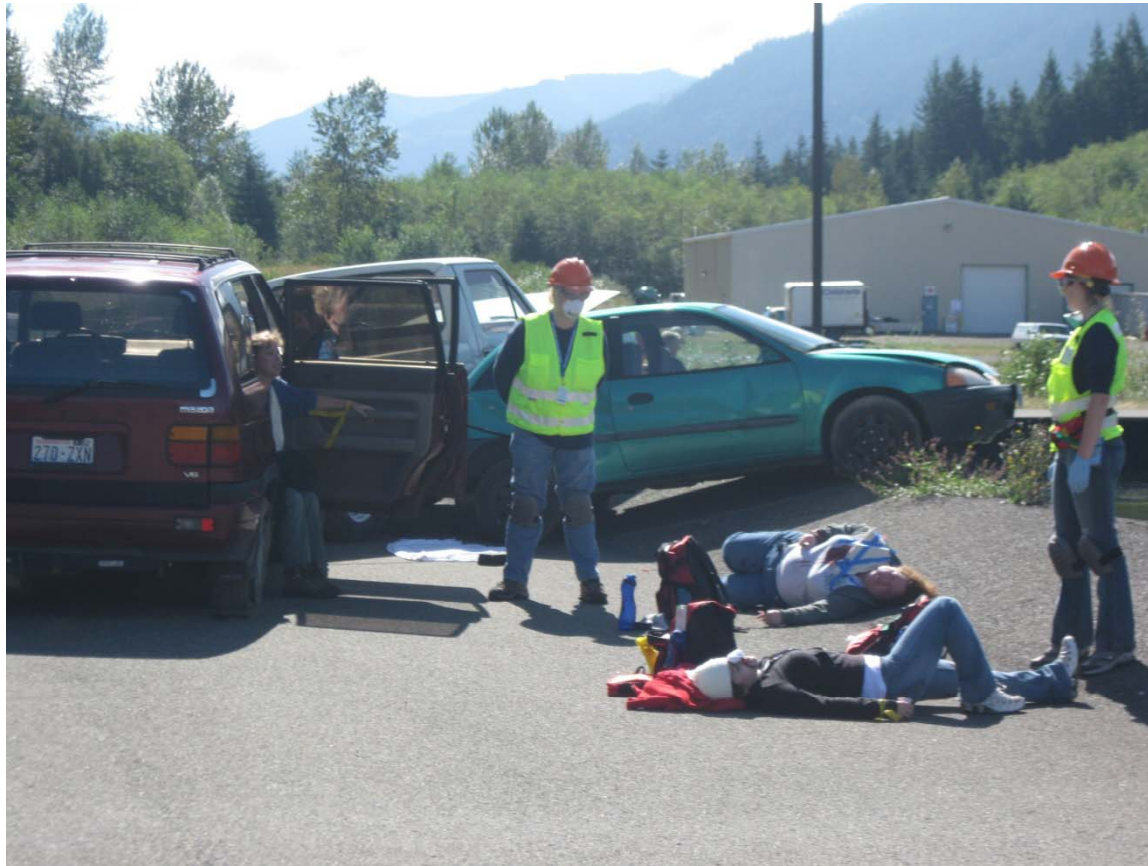
Car Wreck! CERT volunteer assisting victims