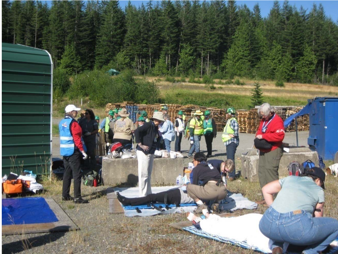
Busy medical treatment area- multiple victims arriving