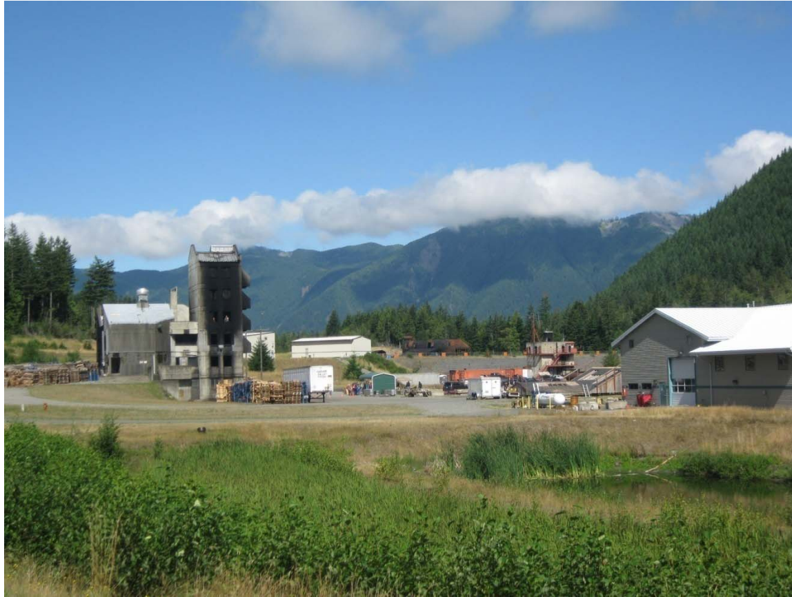
Fire Training Center – note green building/shed in center is where the medical treatment area was located, as directed by Incident Command.