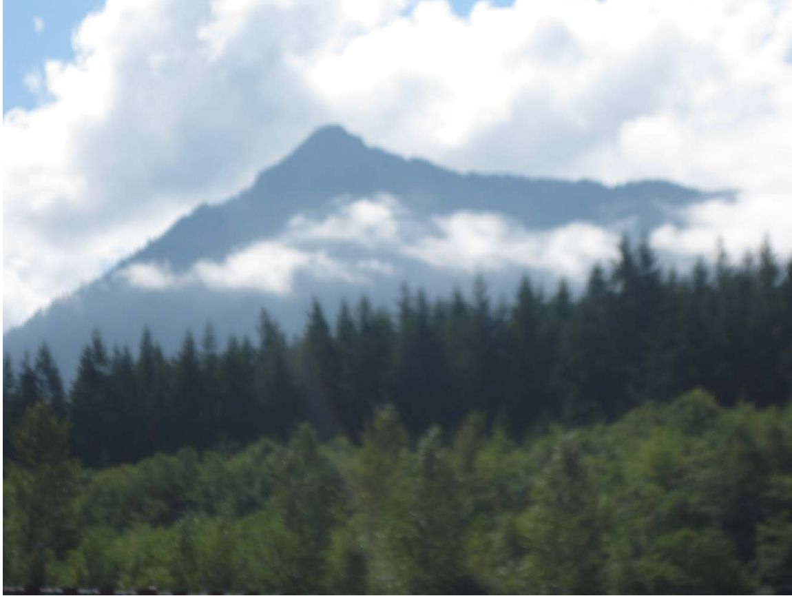
Fire Training Center nestled in Cascade foothills