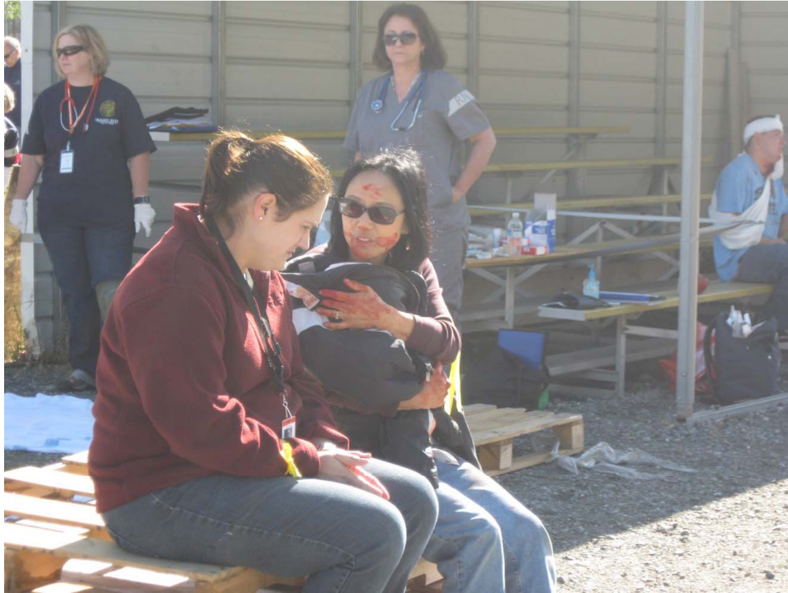
Victims comfort each other