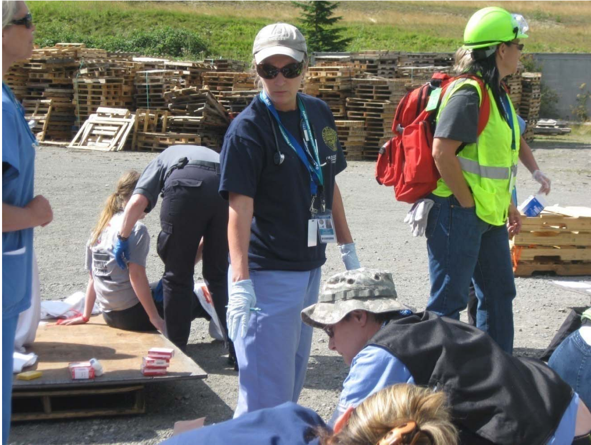
Organizing treatment area