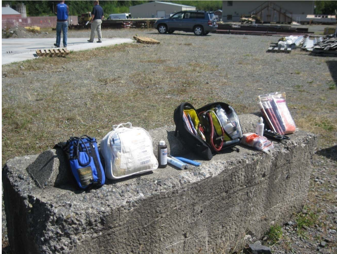
Go bags on display