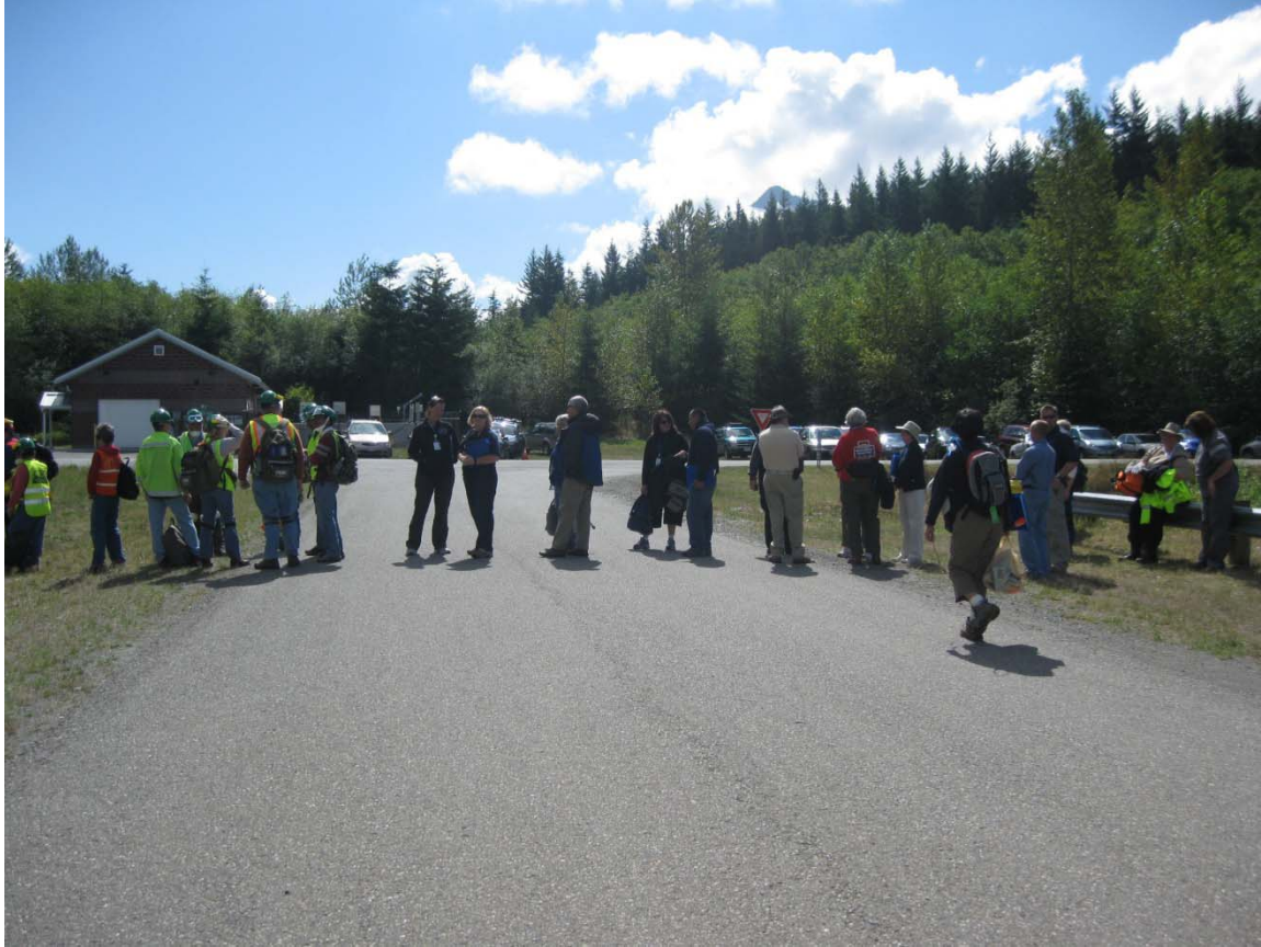
Waiting for lunch!