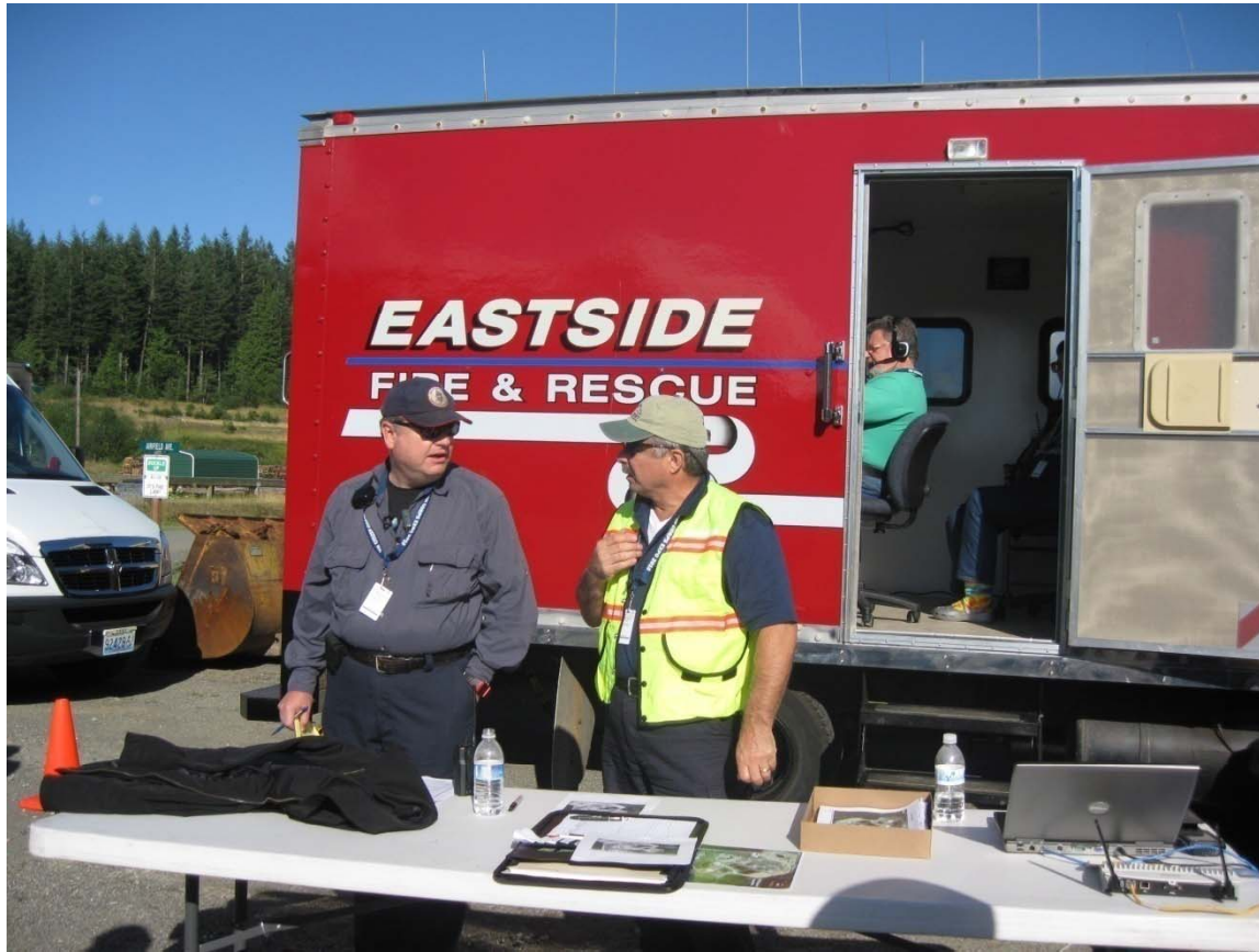
Incident Command getting ready for start of exercise