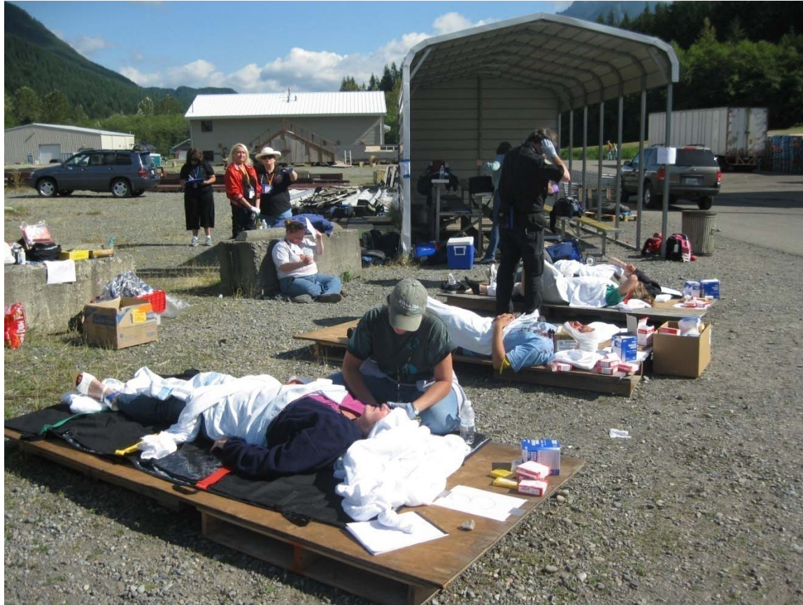
Making use of plywood beds- over 20 patients assessed in treatment area