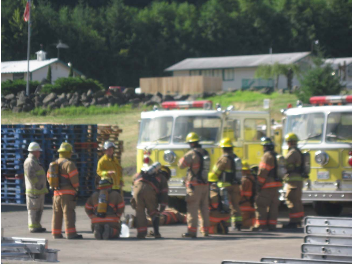
Firefighter Training was also taking place on-site