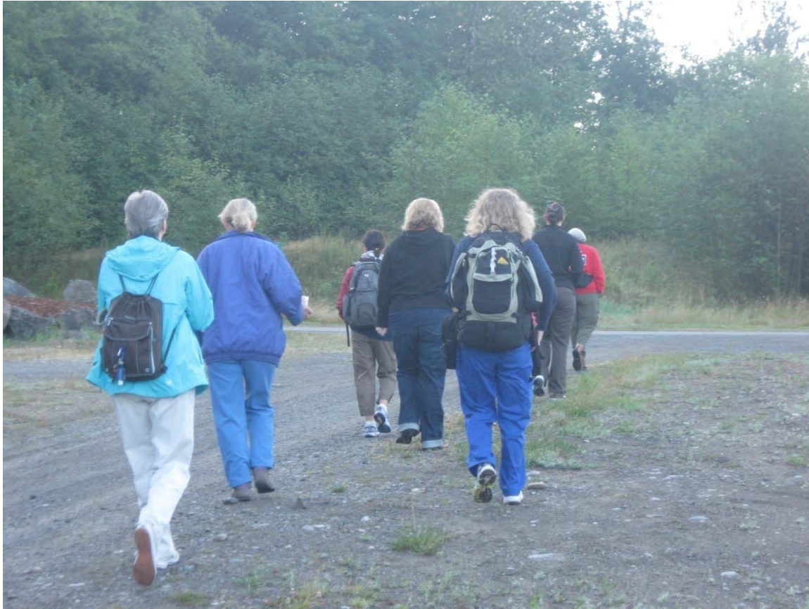
Walking to the Morning Briefing