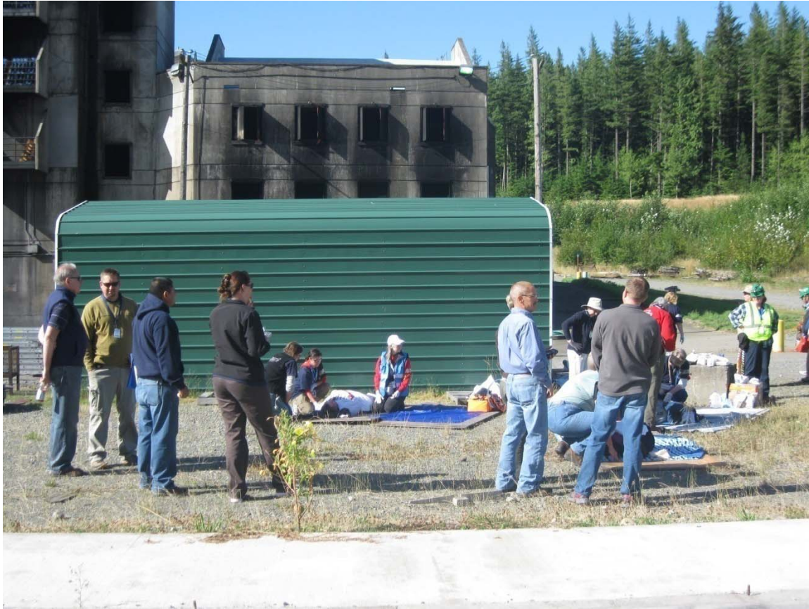
MRC Team 1 – Medical Treatment Area