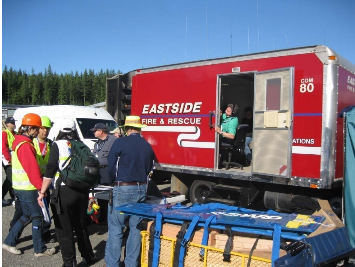
Incident Command Post