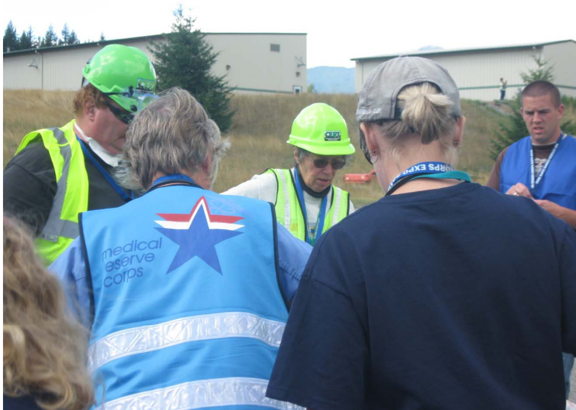
MRC Team 2- Patient intake