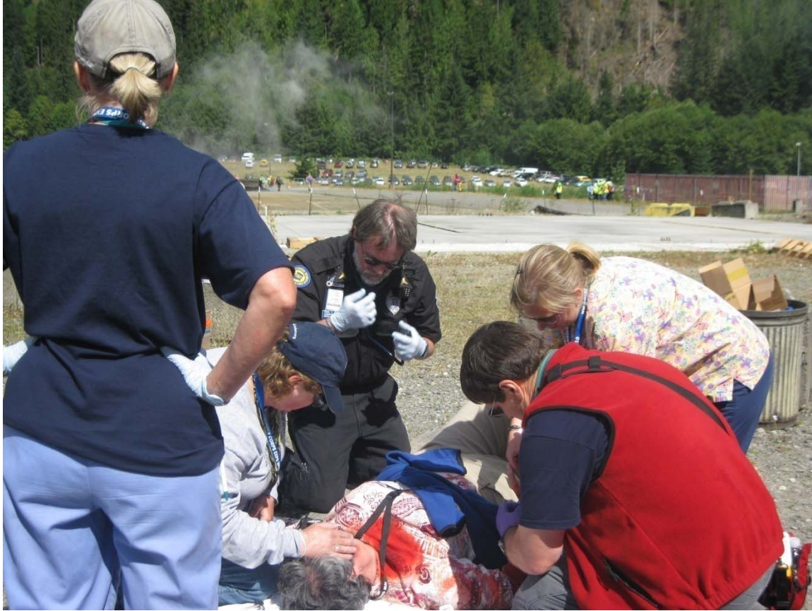
Assessing patient as a team