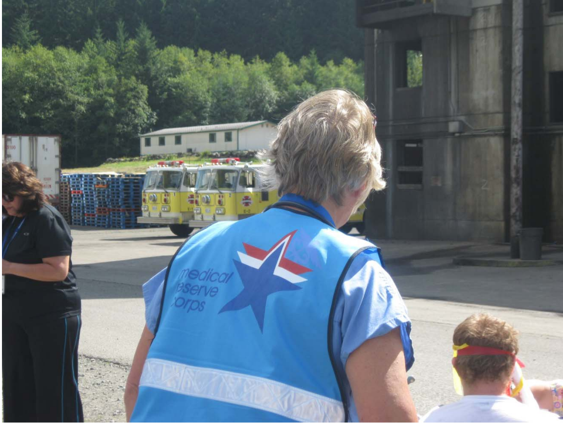
MRC Team 2 Leader