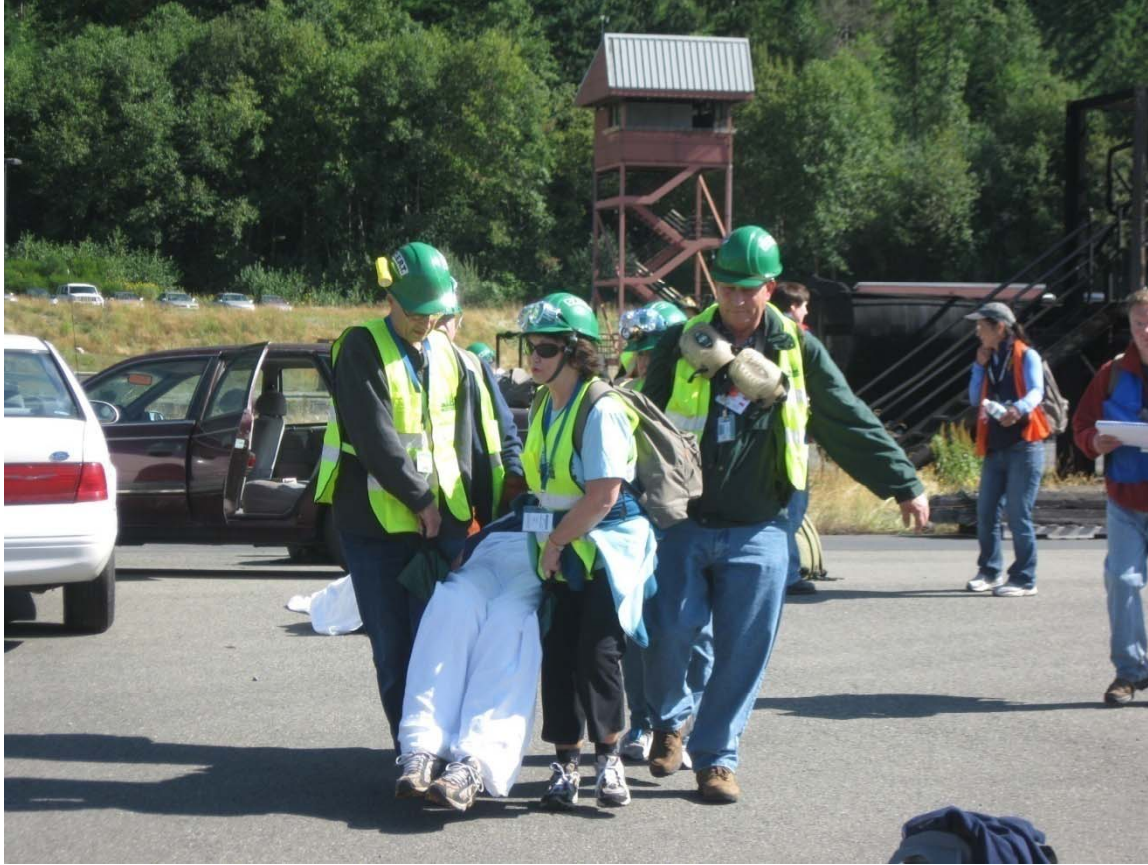
CERT volunteers transporting victim to medical treatment area