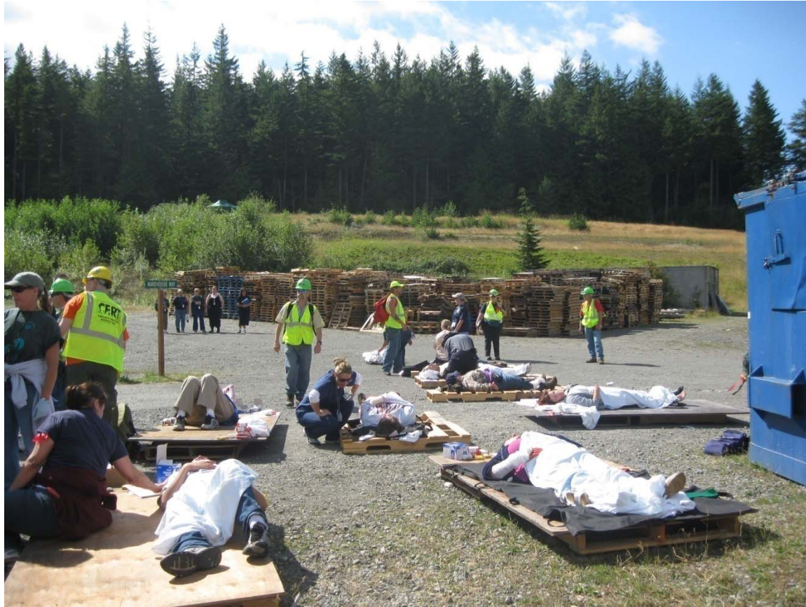
View of the MRC Team 2 treatment area