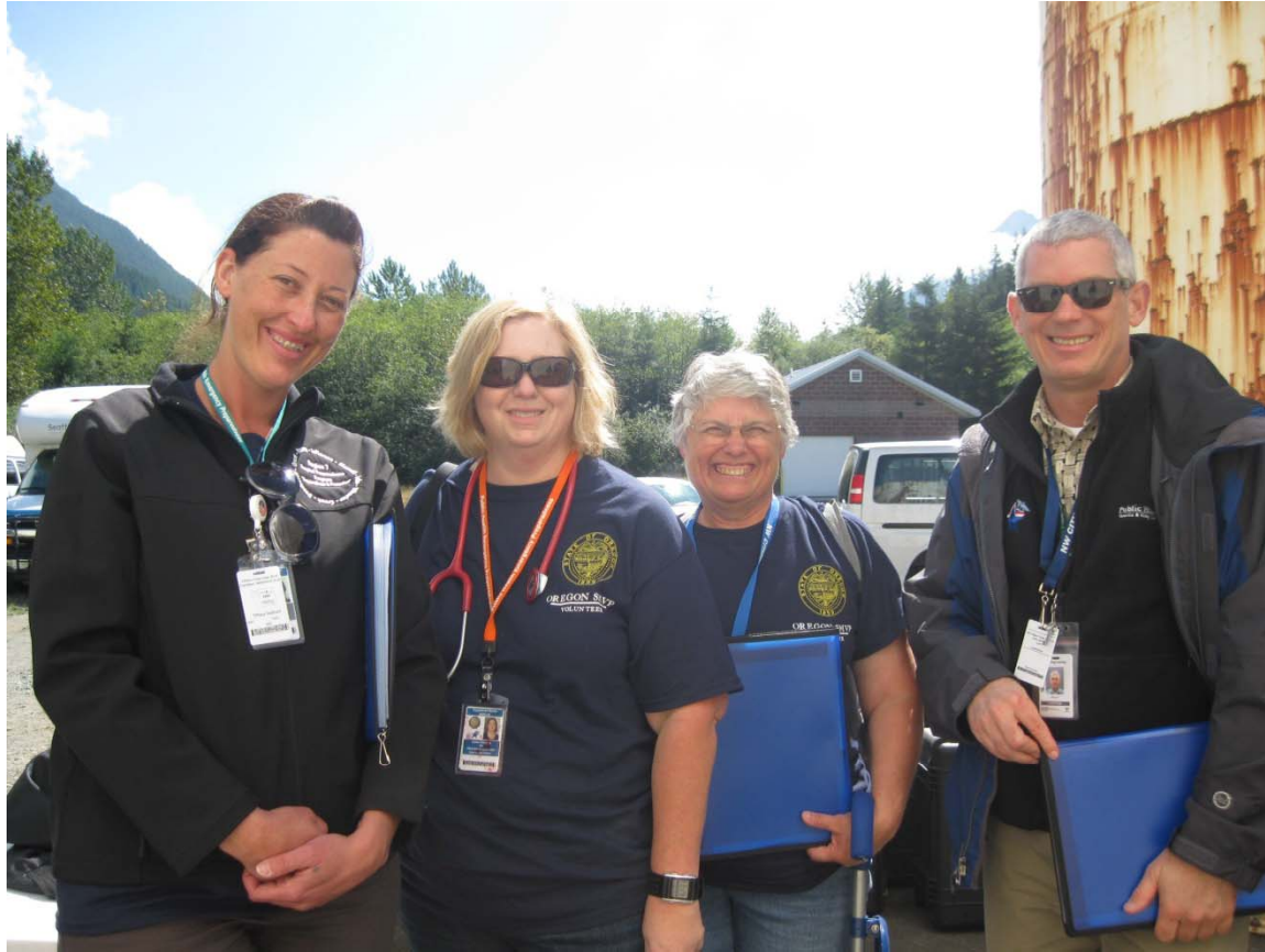
All smiles after the morning exercise and before lunch