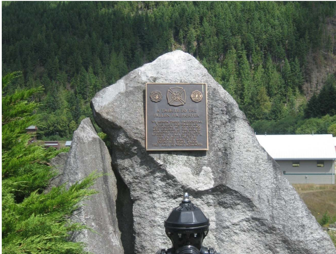
Tribute to fallen firefighters