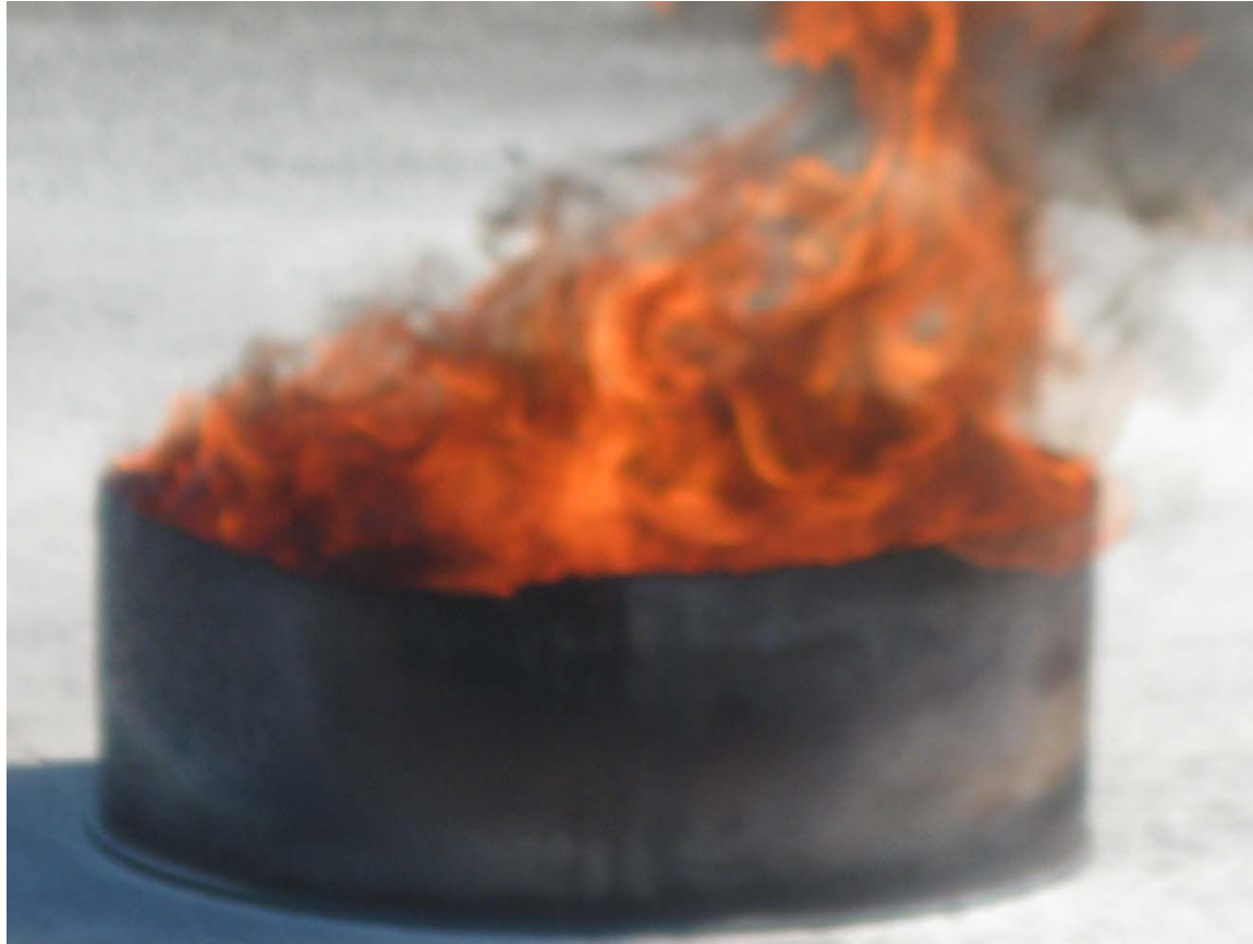
Burn Barrel for CERT Fire Extinguisher Training