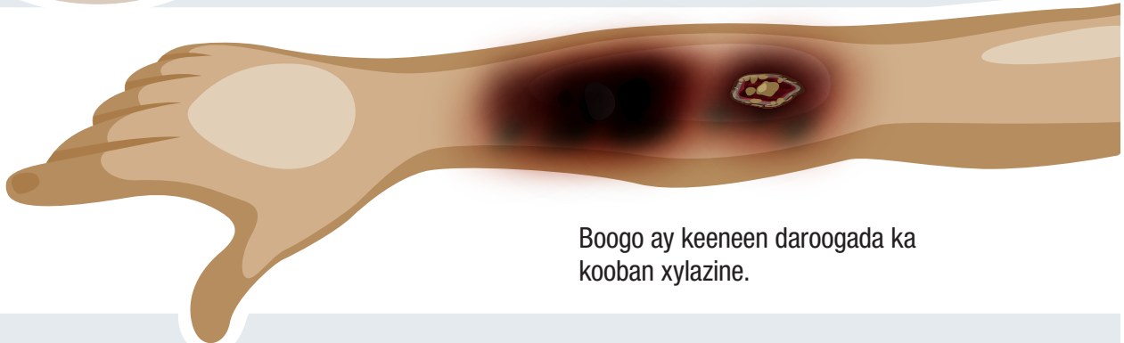
Boogo ay keeneen daroogada ka kooban xylazine.

Xylazine waxay sidoo kale keeni kartaa ciriiriga geesaha xiddidada dhiigga ‘peripheral vasoconstriction’ iyo boogo daran.