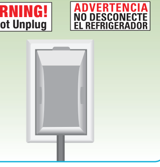
Post "Do Not Unplug" signs near outlet.