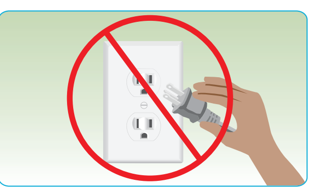
Never unplug the vaccine refrigerator or freezer.

Do not use outlets that are controlled by wall switches.