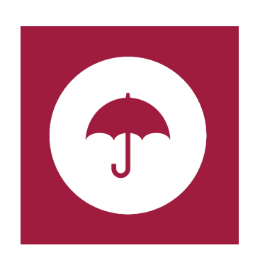
Maximizing coverage through the Oregon Health Plan

Our policy concepts break down the drivers of health inequities into four actionable sub-goals: