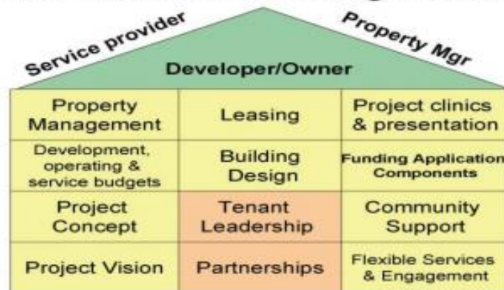
The Institute Building Blocks