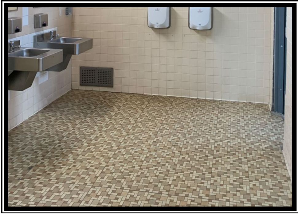
Figure 4 – Difficult maintenance of existing floor finish.