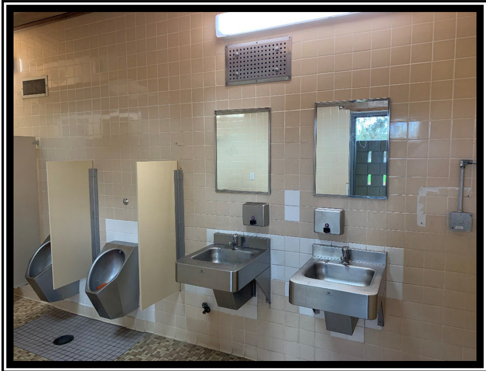
Figure 3 – Numerous repairs.