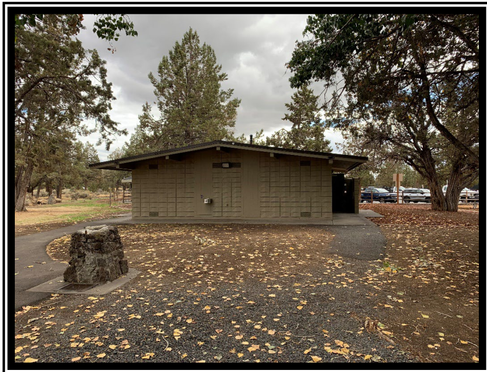
Figure 2 – Wall-mount drinking fountain and inoperable free-standing drinking fountain.