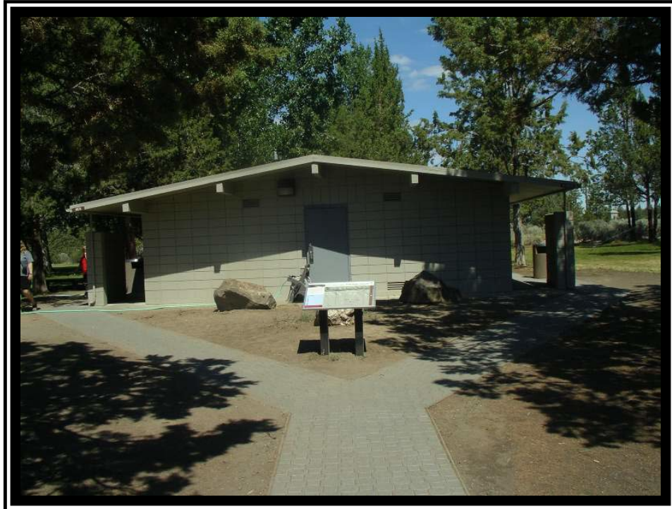
Figure 1 – Existing restroom building.