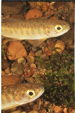
Coho Habitat Restoration

Projects that acquire interests in water from willing sellers. Acquisitions result in legally or contractually protected instream flow to maintain or restore streamflows for the benefit of watersheds and habitats for native fish or wildlife. Eligible applicants are entities qualified to develop valid water rights transactions and oversee the desired outcomes.