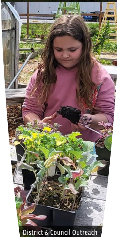
District & Council Outreach