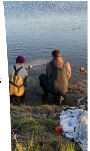
Seine Net Monitoring

Projects that develop a technical design or implementation plan for restoration, including consideration for compliance with the National Historic Preservation Act.