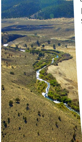
Aquatic Habitat for Native Fish (FIP)

Landscape-scale restoration investments that address board-identified Focused Investment Priorities of significance to the state. Successful FIPs achieve clear and measurable ecological outcomes; use integrated, results-oriented approaches as identified through a strategic action plan; and are implemented by a high-performing partnership. Funding supports partnerships with up to $12 million over 6 years. Initiatives must support limiting factors outlined in a federal recovery and/or state conservation plan(s). Funds are awarded through project-level grants in restoration, technical assistance, stakeholder engagement, monitoring, and land and water acquisitions.