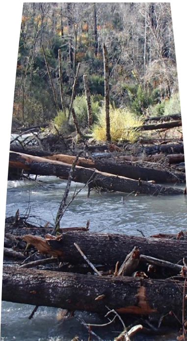
Small Grant Restoration

These federal grant funds are awarded to OWEB to use in local grant investments for restoration partners to acquire, restore, and enhance coastal wetlands. All projects must have long-term protection in place to ensure conservation (such as a termed easement).