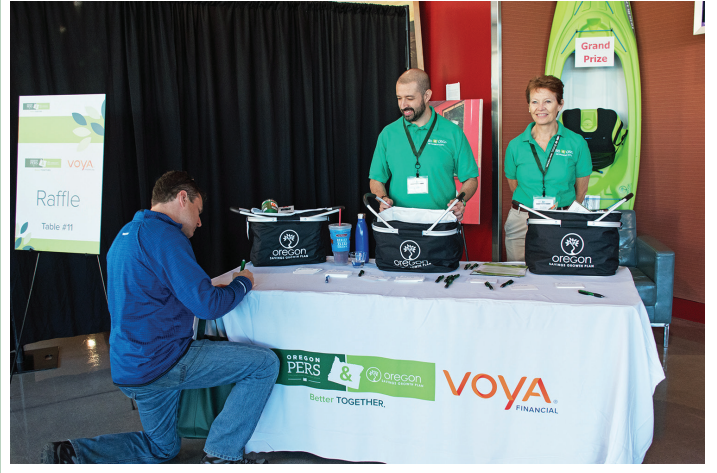
One lucky public employee won an Oregon Savings Growth Plan-branded kayak at the Expo raffle.

"After the Expo, I realize there is so much more I need to know before I consider retiring." - PERS member