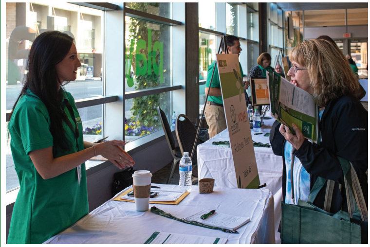
Expo staff spent the day answering questions and helping members understand their future retirement benefits.

On Thursday, October 11, thousands of public employees filled the Salem Convention Center for PERS/OSGP Expo '18: Explore Your Financial Future .