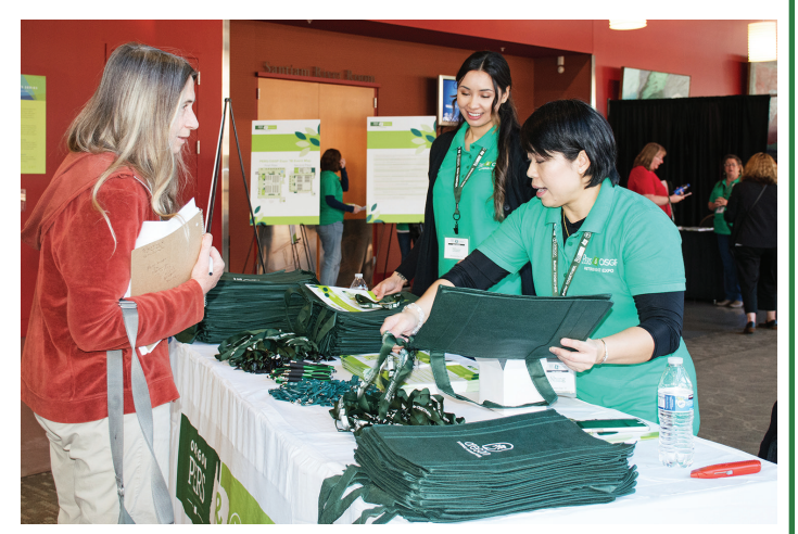
PERS staff members welcome public employees to Expo '18.