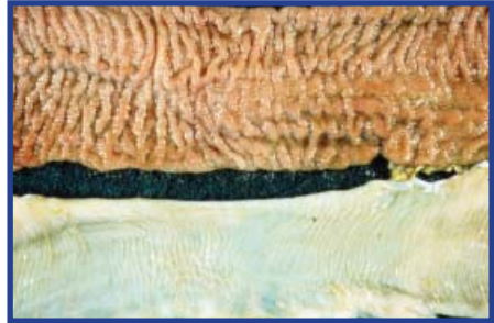
Top ileum: Inflammatory response to MAP. Bottom: Thin, pliable, normal intestine.

A: When an animal is infected with MAP, the bacteria grow slowly in the last part of the small intestine called the ileum. The wall of the ileum contains Peyer's patches that are covered with a layer of M cells. As the M cells circulate in the animal's lumen (the cavity where digested food passes and where nutrients are absorbed), they ingest bacteria (such as MAP) then return to the Peyer's patches. Once delivered to the Peyer's patches, MAP finds an ideal place for growth.