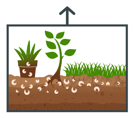
Japanese beetle larvae feed on roots of grasses, severly damaging the plants. Japanese beetle larvae overwinter 4" - 8" below the surface.