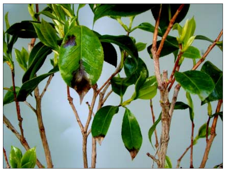
Figure 6 (far right).—Leaf spots on Camellia japonica caused by P. ramorum .

Figure 5 (near right).— Symptoms on Camellia include leaf lesions and defoliation