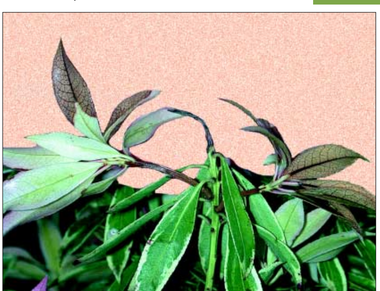
Figure 7.—Leaf and stem necrosis and shoot dieback on Pieris japonica .