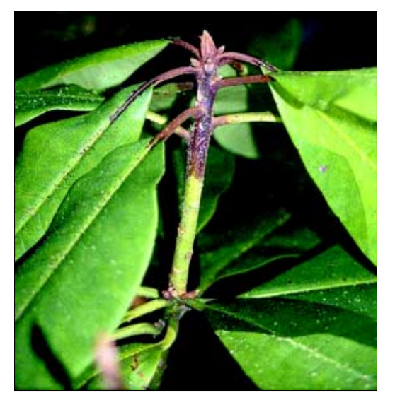
Figure 12 (at right, below).— Ramorum shoot dieback on wild