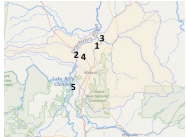
Water Quality Monitoring Locations 2017