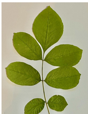
Oregon Ash leaf