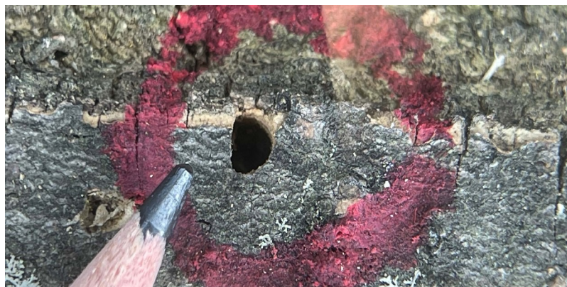
D-shaped emergence hole