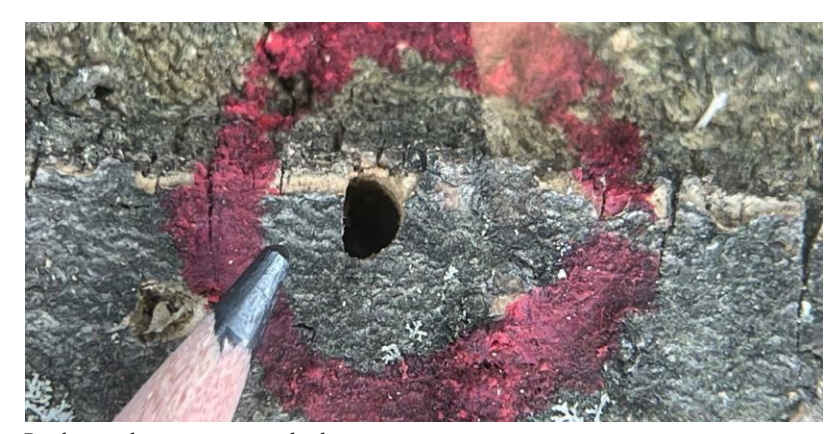
D-shaped emergence hole