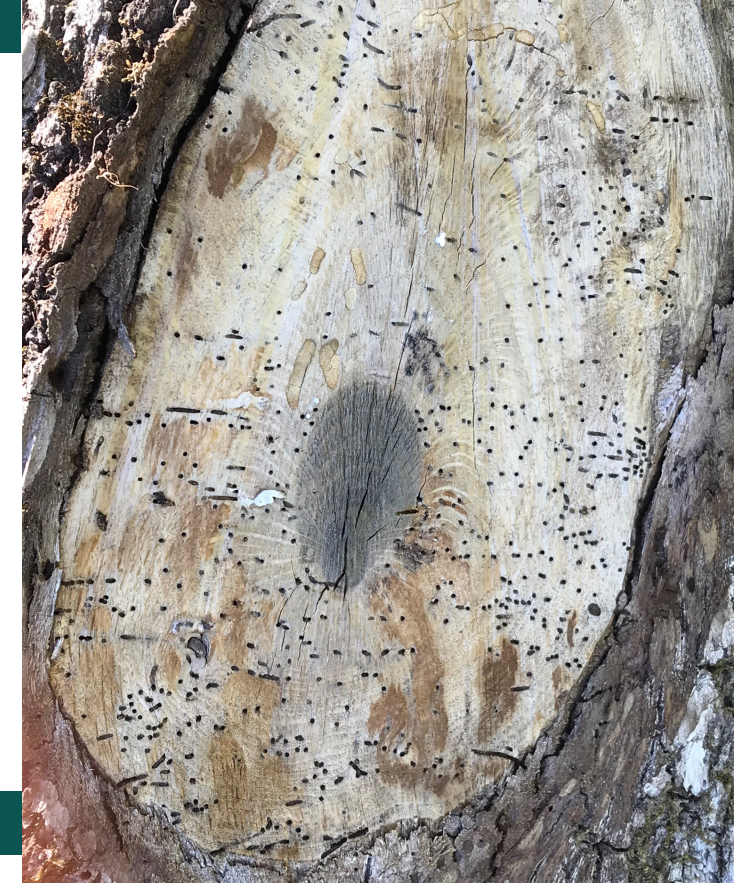
MOB Boring holes riddling an oak branch.

MOB is an ambrosia beetle. Ambrosia beetles don't feed directly on wood but inoculate the wood with symbiotic fungi and other microbes. The beetles feed on the fungal growth. Most female ambrosia beetles mate with their brothers in the host tree, therefore females leave already mated and ready to infest a new tree.