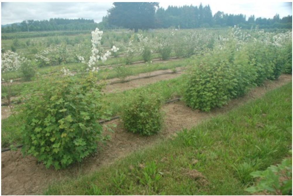
Fig. 2. Segregating population for dissected leaf and compact habit. These traits appear to be linked and all plants with dissected leaves are much more compact.