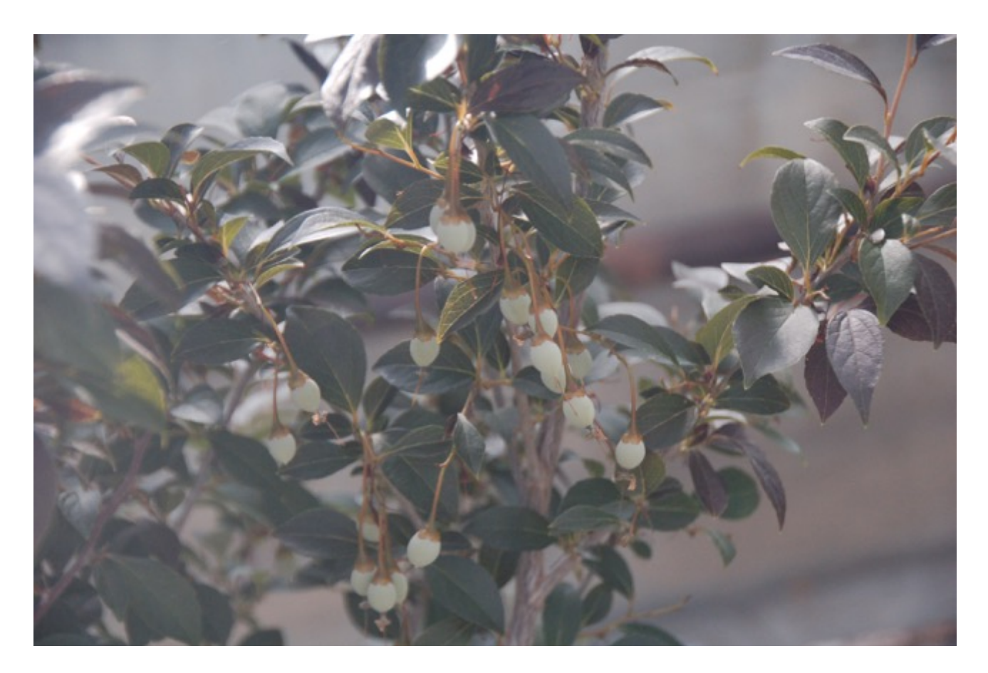
Fig. 9. Fruit set on 'Evening Light' japanese snowbell (July 21, 2016).

Cercidiphyllum japonicum. We have 10 'Red Fox' x 'Morioka Weeping' plants from 2013 crosses and 76 from 2014 crosses. Also, from 2014 crosses we have 16 'Red Fox' x 'Amazing Grace' plants. These are all field planted at the Lewis-Brown Hort Farm and growing well. None of these plants have flowered. Improved production methods have been implemented including improved training and irrigation. I expect these improvements will expedite this project. Also, we have rooted 2 genotypes that we will try to force to flower in containers. While I was unsuccessful in the past, we are also considering attempting to encourage flowering using GA treatment of field plants.