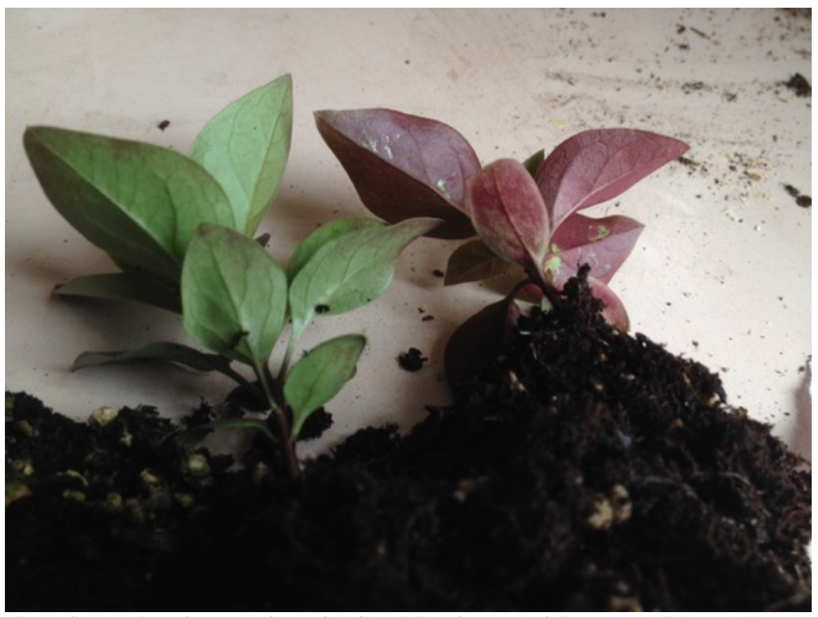
Fig. 7. Segregation of progeny from 'Old Glory' lilac for purple foliage. In addition to being attractive, I hope pigmented foliage is related to disease resistance to allow early selection for disease resistant progeny.

Cotoneasters. Three selections of cotoneaster developed at OSU that are fire blight resistant in our greenhouse studies have continued to be distributed nationally. Currently, we have sent these selections at Kansas State University, Virginia Tech, University of Georgia, and at 7 nurseries. University collaborators will be collecting and reporting formal data on growth and disease. I hope nurseries are able to provide scheduling estimates, which will be critically important data when other growers are considering if these may be profitable cultivars for their product line.