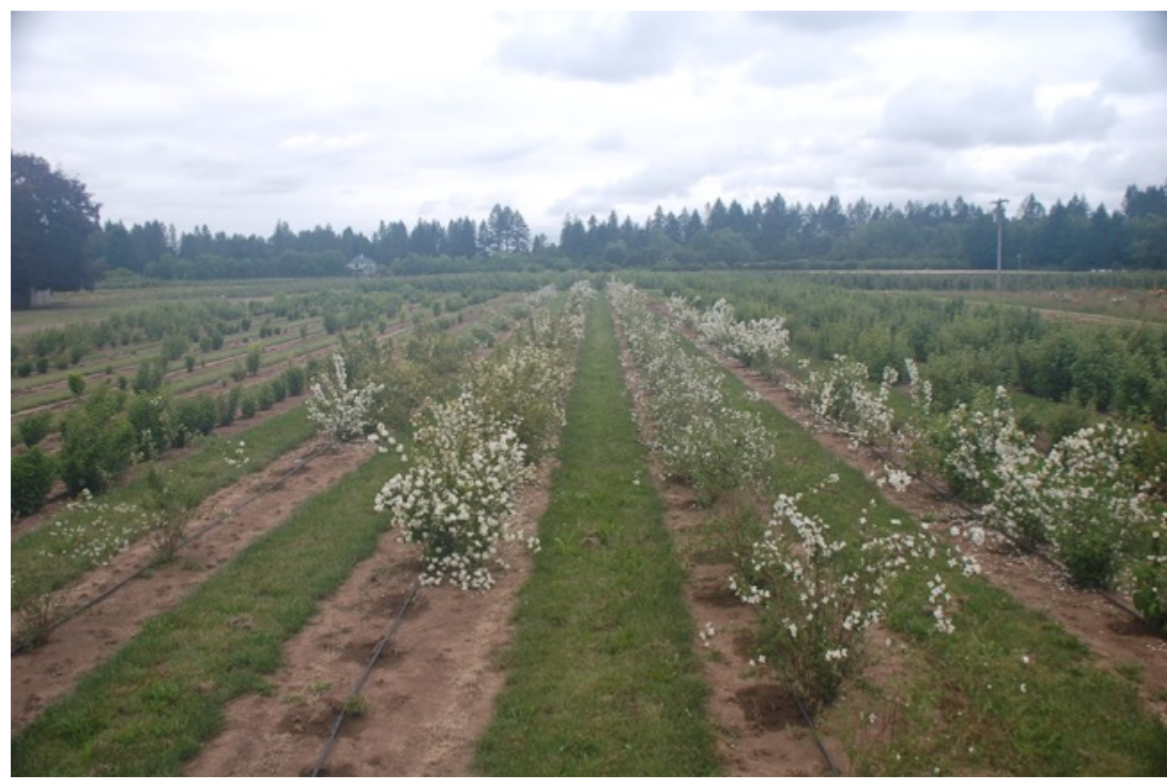
Fig 3. 2014 mockorange population. Selection and removal of inferior plants will begin fall 2016.

Sarcococca confusa. Of the seven selections from the M1 population, 6 have continued to maintain their desirable habit. Brief descriptions are found in Table 7. I also have kept 8 plants from the M2 population that are promising, mainly for compact "non-wild" habit. I plan to propagate these in 2017, after another season of evaluation.