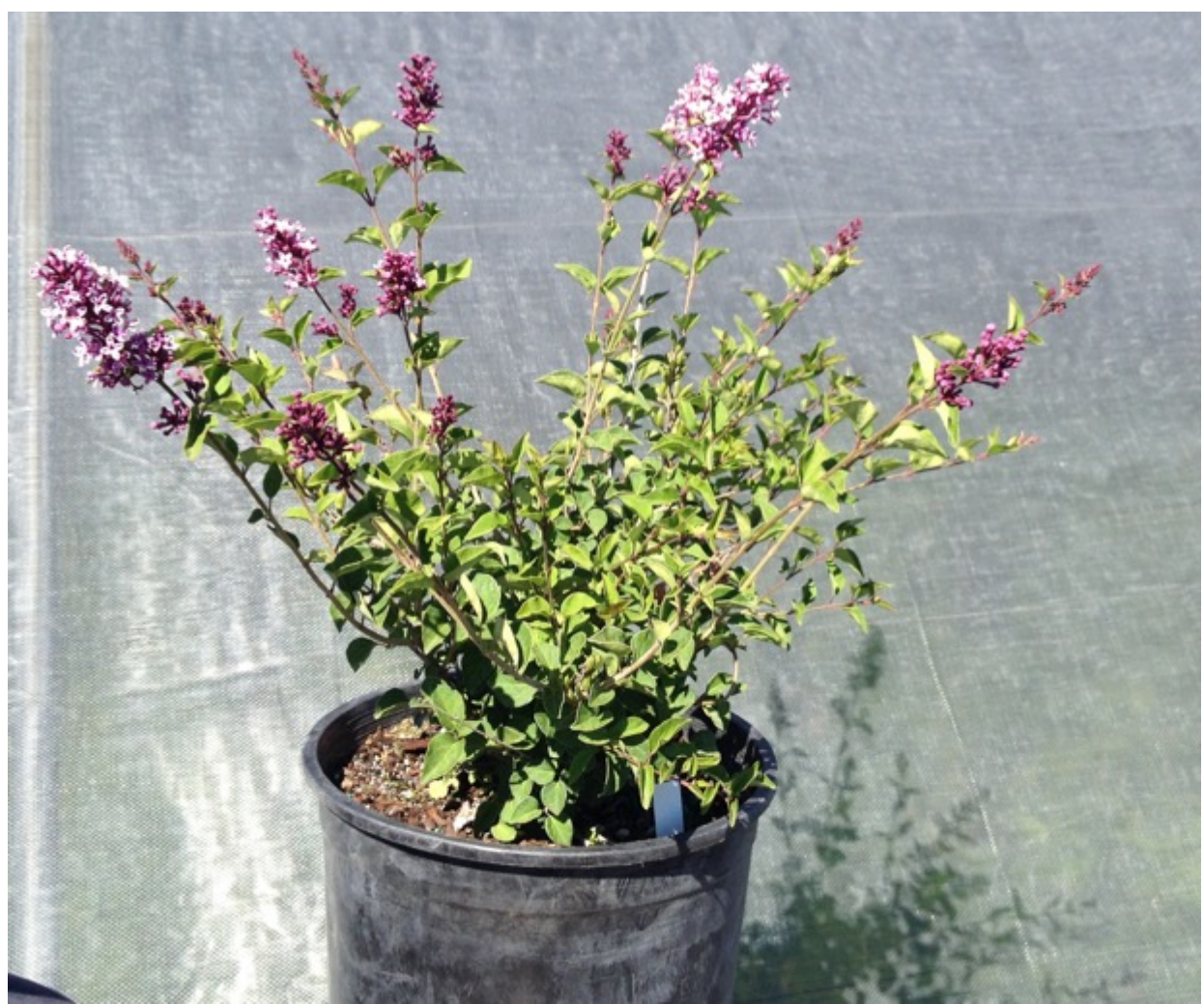
Fig. 6. Lilac hybrid of Palibin x Bloomerang on June 30, 2016. This plant clearly shows the reblooming trait for which we are selecting and at this point is a better rebloomer than available cultivars. While it is early in evaluation, I am optimistic that we will release plants that are better growers, have better blight resistance, and better reblooming than available cultivars.

collected from F1 plants and are in cold stratification. I expect a high degree of variation in this population. It is possible that we could begin using our marker(s) in development on this population to expedite selection. Assuming even modest germination, marker assisted breeding will be quite useful to reduce population size.