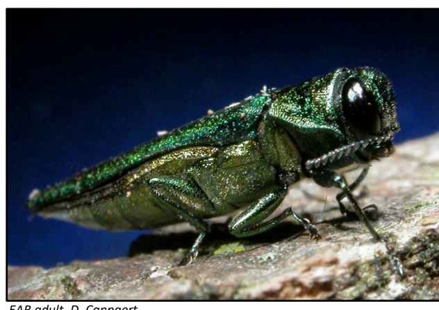
EAB adult. D. Cappaert.