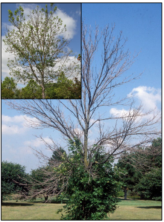
Dead canopy and epicormic shoots of tree with severe decline caused by EAB. Inset: Infested ash tree at the initial detection site in Forest Grove, Oregon. Note the thinning canopy.

EAB is more often detected by keen eyes than by traps. In 2015, Oregon Department of Forestry, with financial aid from U.S. Forest Service and in conjunction with Oregon State University Extension, Oregon Department of Agriculture and the USDA Animal and Plant Health Inspection Service, developed a program to train over 500 of Oregon's natural resource specialists from local and state agencies on how to detect and report EAB and other invasive pests. Read