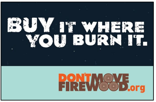
Ash firewood should not be moved. Campers should buy kiln-dried firewood at campgrounds.

Other management options include pre-emptive removal of ash near an active infestation. Municipalities are encouraged to inventory ash trees and have a plan to spread the cost of ash tree removal over several years. Once removed, ash trees should be chipped to pieces one inch in dimension to stop the growth of EAB insects inside the tree. The chips should be covered with thick plastic or buried to stop the spread of EAB adults that may still emerge. Ash is a wonderful firewood but is also a prime pathway for the insect to move across the state. Therefore, ash firewood that is recently cut and split should also be covered by thick plastic for at least one vear. Firewood should not be moved more than 30 miles from where it was harvested. See https://www.dontmovefirewood.org/.