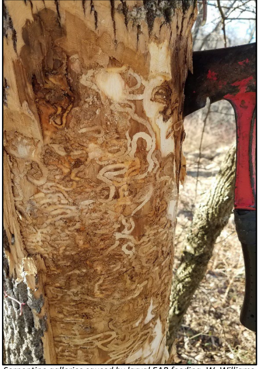
Serpentine galleries caused by larval EAB feeding. W. Williams

There are certain signs and symptoms that are characteristic of EAB, most of which are very long lasting, well after the insect has completed its development and left the tree. If the bark of affected trees are removed, one can observe the meandering "serpentine-shaped" galleries caused by hundreds and even thousands of larvae