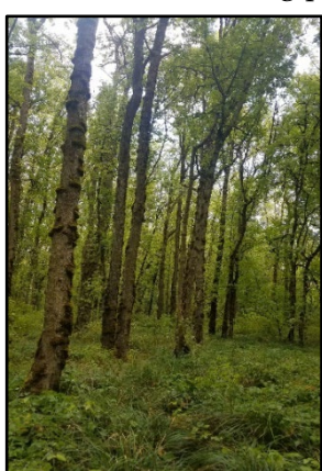
Stand of pure ash is home to elk and other wildlife species. Ankeny National Wildlife Refuge.

Because the threat of EAB has been known for some time, Oregon has led the effort among states on the West Coast to prepare for this destructive pest. With financial assistance from the U.S. Forest Service State and Private Forestry program, ODF is collecting 1 million seeds of Oregon ash from across its range in Oregon. The seeds are being sent to researchers at USDA Genetic Resource Center near Cottage Grove, Oregon, as well as the USDA Seed Lab in Fort Collins, Colorado. Seeds were collected following a protocol that is designed to capture the genetic diversity of Oregon ash in the state. The hope is that one day there will be tree breeding programs to develop Oregon ash that is resistant to EAB and restore affected areas. The seed collection will provide genetic material to start the breeding program.