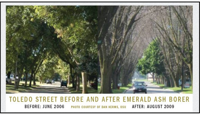
Street trees, before and after EAB, Toledo, Ohio. EAB can move through an entire community in 3-10 years.

Graduates of the Pest Detector program and any member of the public can report a suspected ash tree through the online reporting tool at <a href="https://oregoninvasiveshotline.org/">https://oregoninvasiveshotline.org/</a>.