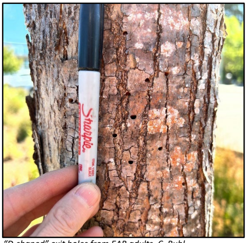
"D-shaped" exit holes from EAB adults.

feeding on the vascular cambium. Second, the adults in this group of beetles leave a characteristic "D-shape" exit hole about an eighth of an inch wide when exiting the tree. Last, after about three or four years of repeated attack and feeding by EAB, ash trees show significant