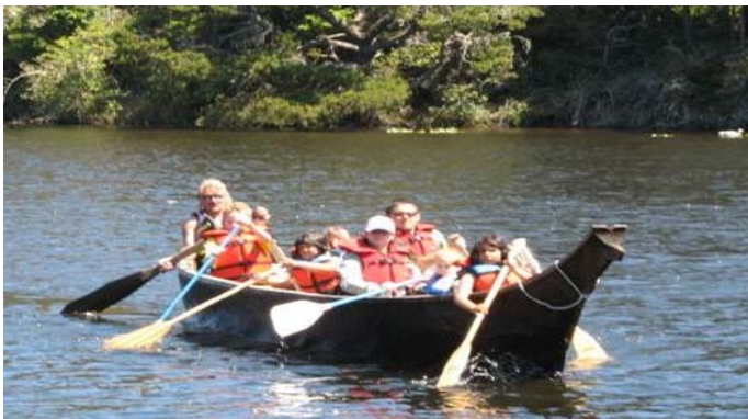
Tribal youth enjoy a summer canoe journey in Coos County.

AMH will post the accepted practices and information for application. A Tribal Best Practices Stakeholder meeting is scheduled for June 10, 2009, from 9:00-1:00 at Kah-Nee-Ta, located in Warm Springs. If you have questions, call Caroline Cruz at 503-945-6190.