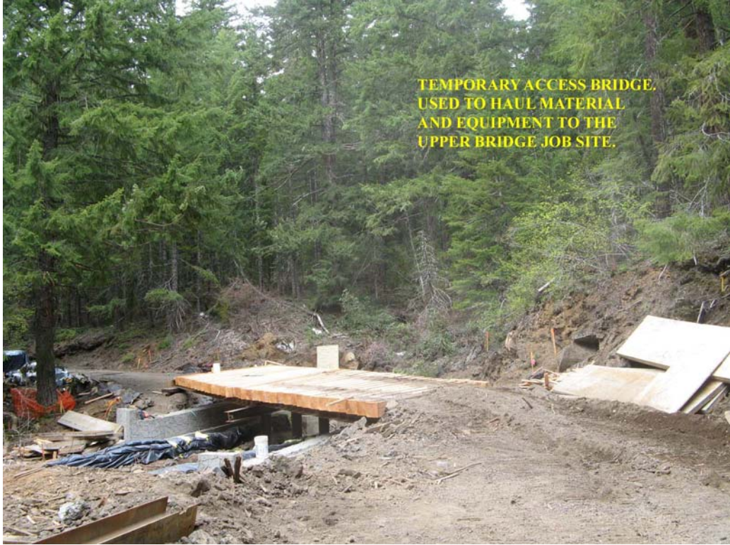
TEMPORARY ACCESS BRIDGE. USED TO HAUL MATERIAL AND EQUIPMENT TO THE UPPER BRIDGE JOB SITE.