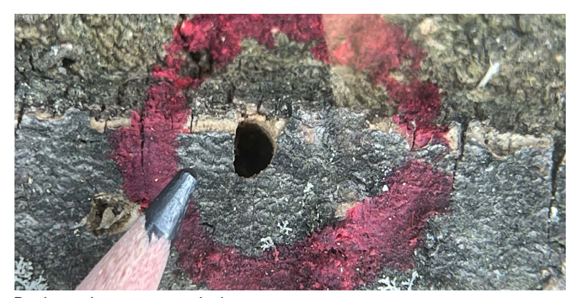
D-shaped emergence hole