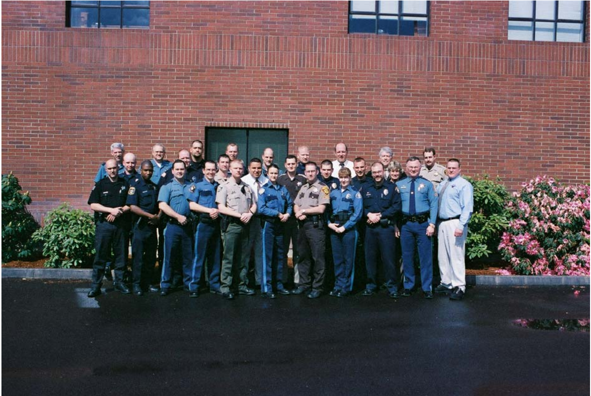
Oregon DRE Class #11 May 2003 Monmouth, OR