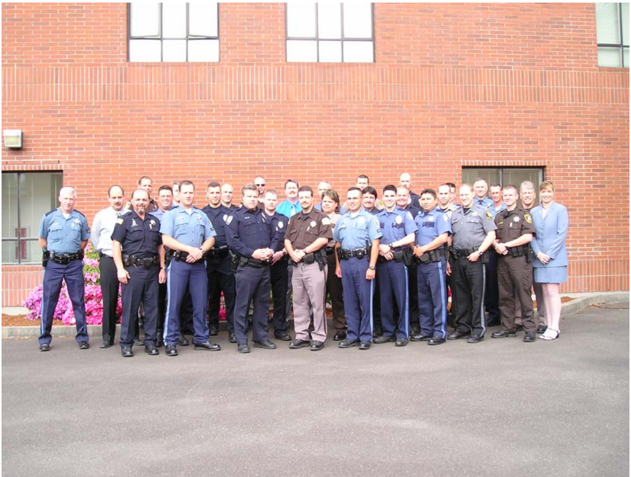
Oregon DRE Class #12 May 2004 Monmouth, OR

During 2004, Oregon conducted one DRE school, training a total of 23 officers as Drug Recognition Experts (DREs). The school was held in May at the Oregon Military Academy in Monmouth. The training included three troopers from the Oregon State Police, eleven officers from city police departments, seven sheriff's deputies, and two officers from Alaska police agencies. All 23 officers successfully completed the school, and then the 21 officers from Oregon completed the certification phase held in May in Portland, Oregon. During the certification phase, 156 DRE evaluations were completed.