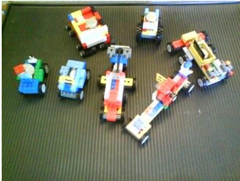
Close up photo of example cars

Four students spent approximately 1 hr. building the seven cars seen in the photo below