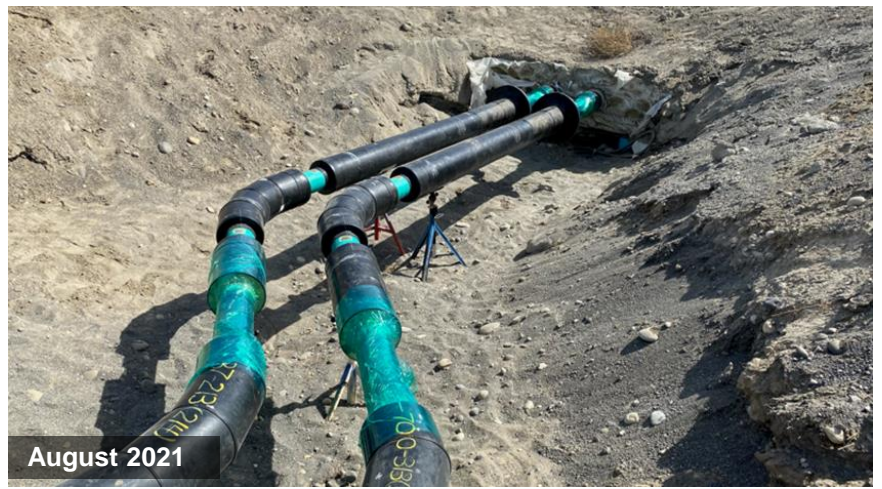
Newly installed waste feed delivery lines between AP Tank Farm and the Low-Activity Waste Facility