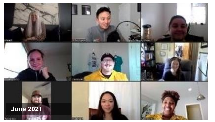
Virtual collaboration and teamwork continues