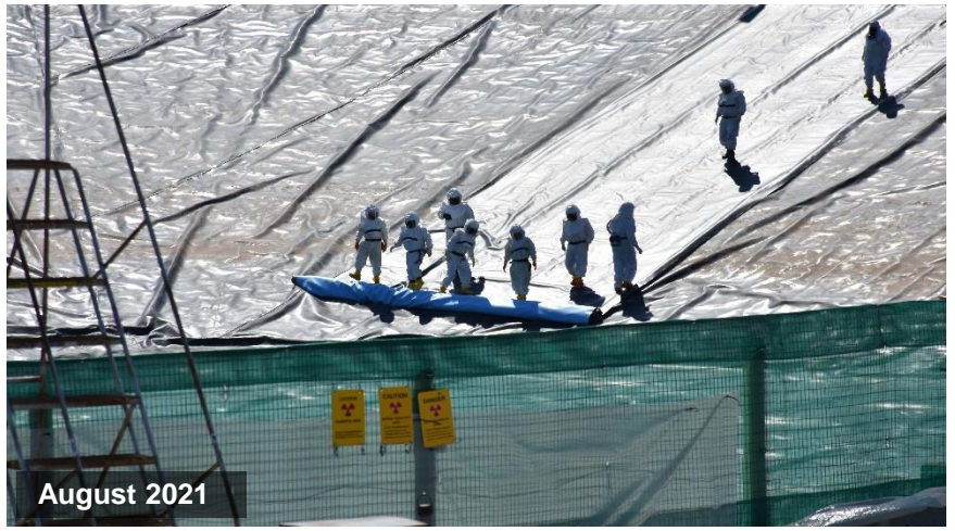
Installing replacement cover on Basin 44 of the Liquid Effluent Retention Facility

Glass-Forming Material Delivery – Melter 1 Heat-Up Closer